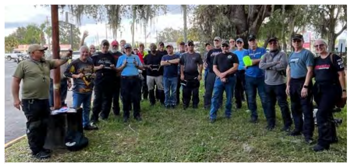
Group pic at the New Year's Holiday Lunch ride

Meanwhile, the nearly 30 riders who attended the Holiday Lunch Ride enjoyed a wonderful day for many reasons. Temps were perfect! The Family Restaurant made all the accommodations required to keep us comfortably together AND did a spectacular job serving us our delicious choices with smiles and efficiency!! Wow! And then there was the gathering under the tree!!