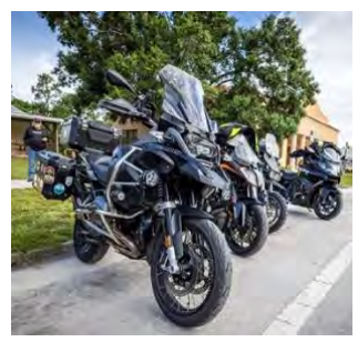
Southies enjoyed a beautiful morning's ride.