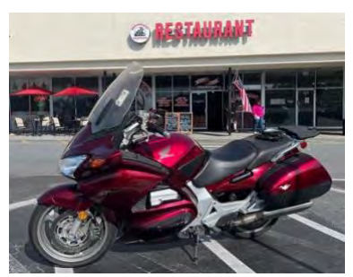
Beautiful riding in the Brooksville area with great weather

Next month, Saturday, July 29<sup>th</sup>, we'll be heading to Yahala Bakery, so make plans to join us!