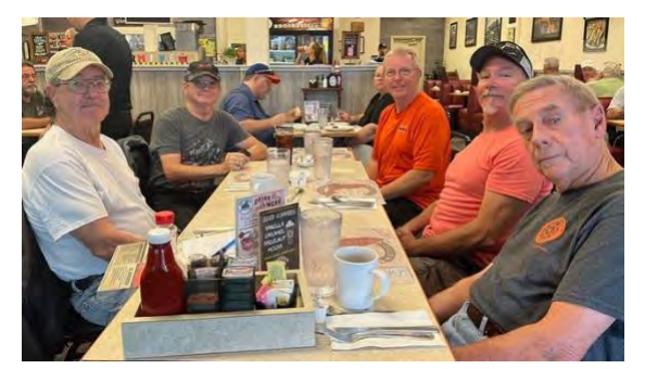
Great, fast service at Breakfast Station in Brooksville

So, in two weeks we get to do it all over again – hopefully with a nicer turnout – Goodrich's Seafood in Oak Hill on July 8<sup>th</sup>. Hope to see all you trepid summertime riders there!