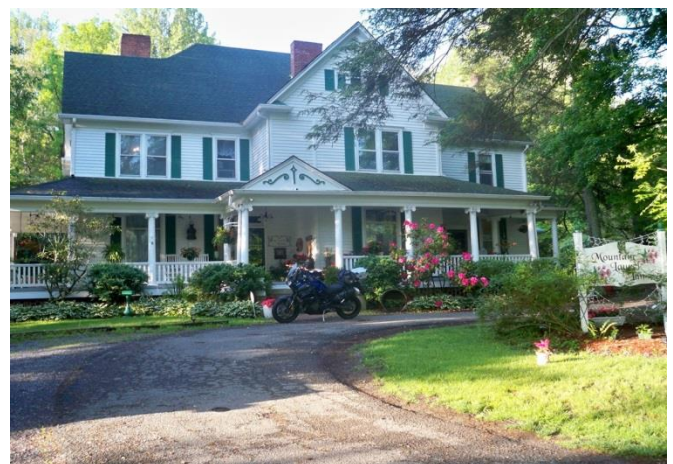
Mountain Laurel Inn in Damascus

I had a wonderful route picked out to do from Hiawassee to Damascus that Sunday and it was everything I knew it would be, but riding was slowed down due to the rain. I left Hiawassee on US 76 East which has some very nice curves over to US 441 North up to US 23/US 74 over to I-40 and Exit 50/US 25 which put me on the Blue Ridge Pkwy. From there it was the BRP over to Little Switzerland and Hwy 226 North up to Bakersville where I caught Hwy 261 up into Tennessee where it becomes Hwy 143, on past Roan Mountain to Hwy 19E which took me over to Elk Park and Hwy 194 to US 421 North up to Shady Valley. From there it was Hwy 133 North up to Damascus and the Mountain Laurel Inn 276-475-8822 owned by Drew and Kathleen. I can't say enough about these people and this place; Kathleen is the perfect hostess. The house, which sits on three acres, is over 100 years old with workmanship that is unbelievable being done in a bygone era with all hand tools. The house is very beautiful as are the furnishings; be sure to stay for her breakfast and to say "hi" to JoJo, the family dog, who is also a sweetheart.