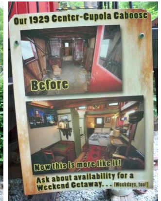
A wild antique store that's like a Man Cave with a caboose that can be rented overnight Black Bear Creek Antiques along US-76 near Clayton, GA