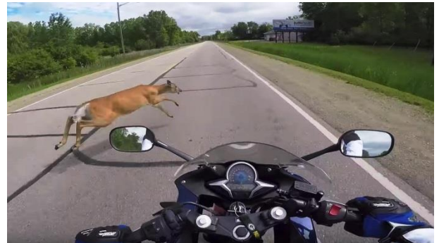
Avoid hitting a deer on your motorcycle

First off, deciding what to do about the wildlife that has suddenly appeared in lane pretty much depends on the animal. Different sizes, types and attitudes demand different responses. You don't respond to a squirrel that can't make up its mind the same way you react to the deer which appears on the road.