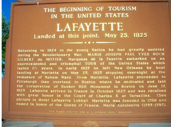
Plaques in a park on the river in Marion, Ohio outside of the Lafayette Hotel

my way north thru Gallipolis, a beautiful little town with a gorgeous and very well maintained city park right on the Ohio River. It has a walkway along the river with big shade trees, monuments for our Veterans and plaques about the town's French heritage. The Bob Evans Farm (of restaurant fame) is located just outside of town. On towards Little Hocking where the fun will really begin as I break off of Hwy 7 to ride some of Hwy 555 , affectionately known as the "Triple Nickel". Hwy 555 is one of nine roads in SE Ohio known as the "Windy 9" ( Windy9.com ), which Ohio says has close to 1,000 miles of pavement to ride. Although they advertise to use Athens, Ohio as your base, Marietta only 50 miles away works very well also. I've ridden seven of the nine and trust me here, they're all good with Hwy 555 my favorite. So it's Hwy 555 north up to Ringgold where I catch Hwy 78 (both are part of the Windy 9) over to McConnelsville and Hwy 60 back down into Marietta. It was an excellent way to finish off an already great day of riding.