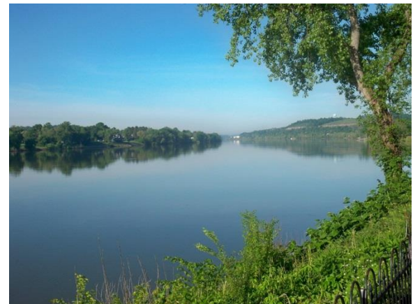
Ohio River at morning

It's now Monday May 6 th with cool temperatures (high 50's) and clear and beautiful skies with no chance of rain today. My lodging tonight will be at the Lafayette Hotel in Marion, Ohio 740-373-5522 , which is located right on the Ohio River and decorated in a Riverboat theme. So it's Hwy 91 North out of Damascus, VA up to US 11 and over to Marion where I catch Hwy 16 North from Marion to Tazewell and beyond. The stretch of Hwy 16 from Marion to Tazewell is called the Back of the Dragon and is 33 miles long with 438 curves of all kinds stretching over 3 mountains. This will be my 3 rd time going from south to north. In a few days I'll be doing it for the 1 st time from North to South, but more on that later. Continuing on past Tazewell up to US 52 West, I ride up thru West Virginia and across the Ohio River into Ohio, where I catch Hwy 7 known as the Ohio River Scenic Byway. Please allow me go back here for a minute to say that even beyond Tazewell, Hwy 16 is still full of curves as are parts of US 52; it was really good riding. The sad part here is that both of those roads take you thru some very poor areas of West Virginia where people are struggling to make ends meet as seen by their living conditions and the small towns in general. It made my heart sad and at the same time made me appreciate how lucky I am and have been in life. But now it's Hwy 7 along the Ohio River and I'm working