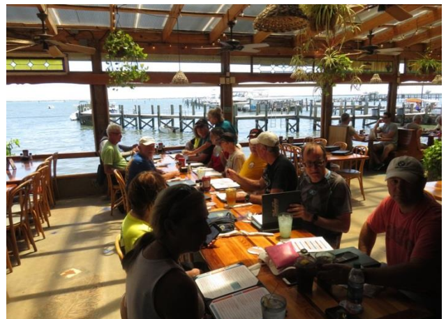
Our group at Capt. Hiram's table.