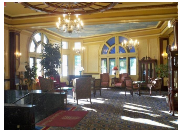
Lobby of the Lafayette Hotel