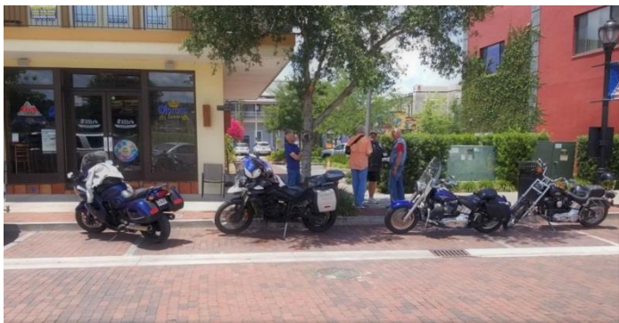
Tillies to the left