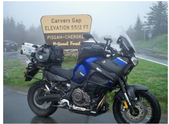
Carvers Gap where I couldn't seem to stand up. It was a really funny moment

A funny story here, one of which I don't have to tell, but will anyway. I'm in nasty weather but still decide to take the Roan Mountain route which because of the elevation becomes even nastier. It's really raining and has even become a little foggy. I park my bike for a photo in front of the Carvers Gap sign (base of Roan Mtn). As I dismount, some small rocks placed there as a landscape border cause me to trip and fall over one of the rocks. If that wasn't enough, as I get up I trip over another rock and go boom again. Please note here that I'm in full riding gear with a rain jacket, pants and helmet and thus not only look like the Michelin Man (in yellow and black) but also move somewhat like him. Now I'm lying on my back looking up at the rain remembering how athletic and coordinated I was in my youth and wondering whatever happened. At this point I'm thinking of that commercial where they say - "Help, I've fallen and I can't get up". Upon getting up, and more importantly remaining up, I looked around to see how many people were pointing at this idiot, but there was no one there. It's always good to laugh at yourself and that's exactly what I did. I guess you really had to be there. 😊