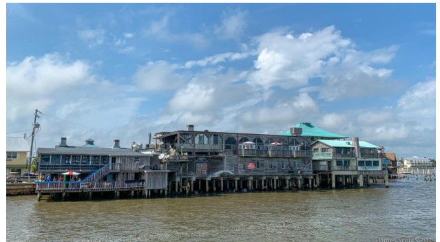
View of Cedar Key business district