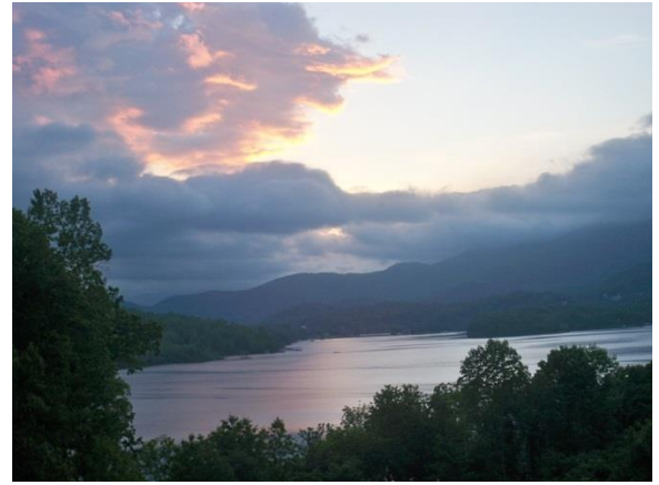
Lake Chatuge from the lodge