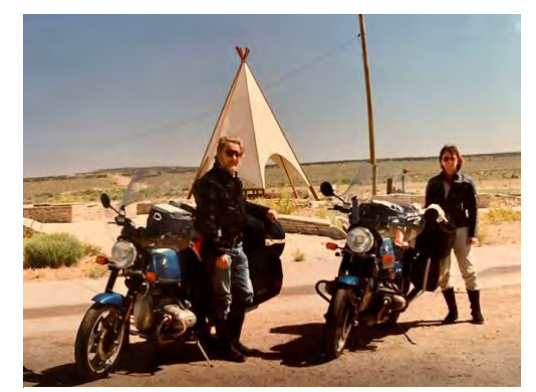
Teepee-covered picnic tables at a rest area in New Mexico

Fast forward from 1987 to 2022. 35 years of traveling on 2 wheels and attending BMW rallies (MOA and RA) and now MSTA and STAR events – how could I not enjoy the scenery, curvy mountain roads, and lasting friendships with other riders. Oh, yes. Let's not forget a