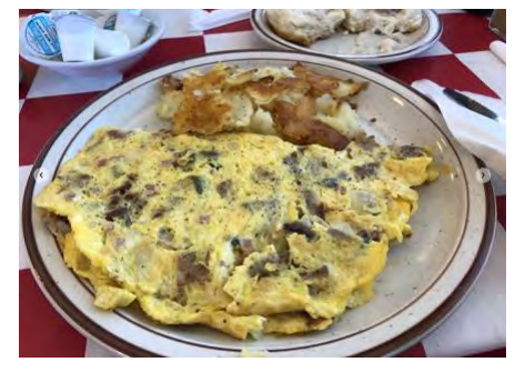
Great riding and food at Johnny's Egg House in Frostproof