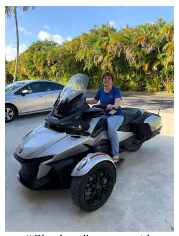
"Charlotte" my new ride a 2022 Can-Am Spyder RT