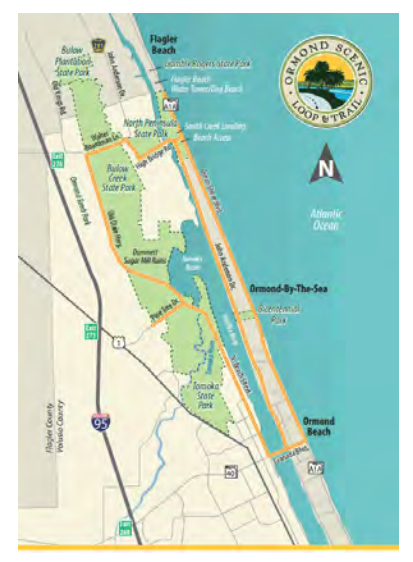
The Loop Trail

To add a little spice, at Port St John just below the power plants, we took King's Highway west to Grissom Parkway and then turned north about 4 miles to