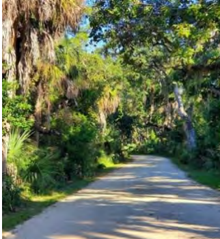
Tomoka State Park

From there we headed north on Beach Street along the Halifax River into the city of <u>Ormond Beach</u>. The Loop Trail starts at Grenada Boulevard (SR 40) . To run it clockwise, there's about 3 miles of residential area along 2-lane North Beach Street .