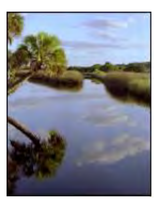
Scenic view along Highbridge Road

On the east side of the Halifax just over the bridge, we found a park on the south side with shaded picnic tables, restrooms and a boat ramp. So we stopped to leisurely dig into our BYO lunches, chat and watch the boat traffic out in the river and the ones launching or trailering. Did I mention, the sun was out all day and temperatures ranged from about 73° to 83° but were mostly in the upper 70's? It was just a beautiful late February day to be out and about.