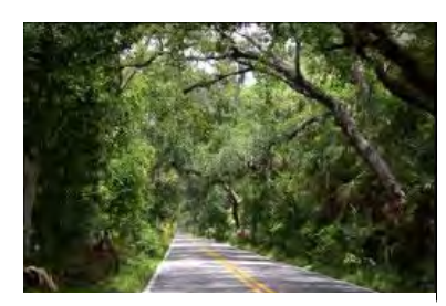
Live oak canopy over Old Dixie Hwy

The nicer homes on larger lots were on the river side to the east. Then we encountered almost two miles of very rural, heavily treed terrain through a section of <u>Tomoka State Park</u>.