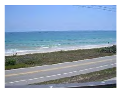
Ocean view along A1A in Ormond-by-the-Sea

From there, the Loop can follow John Anderson Drive about 9 miles south along the east side of the Halifax to SR 40 . The first part of it is more rural. Or you can continue east 0.2 miles to A1A and follow it to SR 40 - whatever melds best with the rest of your day's plans. Of course, you can also run the Loop counter-clockwise.