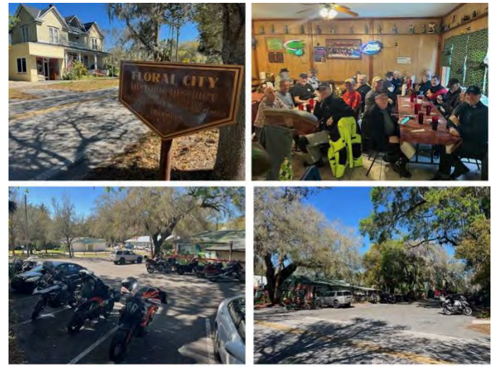
17 riders rode some of the backroads in the state to Floral City for the West Central Ride.

for our annual foray down to Solomon's Castle in Ona.