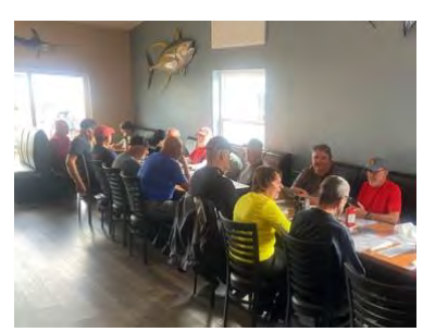
3 tables of hungry riders enjoyed the tasty offerings at Saltwater Marina Restaurant in Sebastian

And our 50/50 raffle fund also had a good month. The East lunch ride generated $32, the South lunch added $42, and the West ride kicked in $60! for a total of $134 in February! We start March with $365.00. Always a BIG THANKS to all who participate.