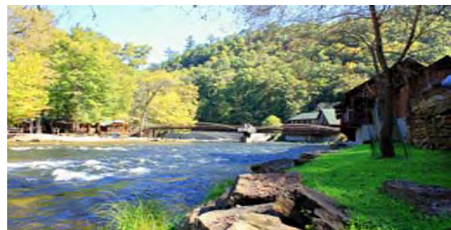
Nantahala Outdoor Center