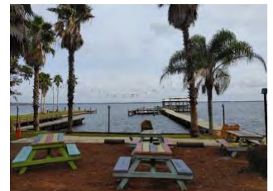
3 Bananas in Crescent City

Saturday was a clear but very windy day. Ten riders braved the winds for a good meal and great comraderie. One of the hot topics discussed was Star 2022. I thank all who turned out.