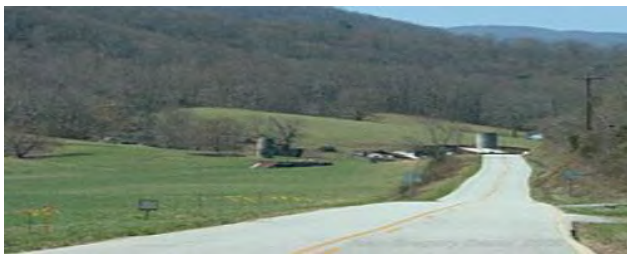
Wayah Road near US 64 before it starts up the mountain

On Friday, Ken and I took 75 north, over the mountain, through Hiawassee and then further north to US 64. US 64 east took us over yet another mountain to the entrance to Wayah Road . Wayah is a fabulous 2-laner with too numerous to mention switchbacks, twists, turns and elevation changes.