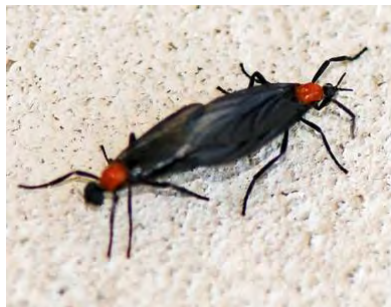
Lovebugs descend on us by the millions each spring.