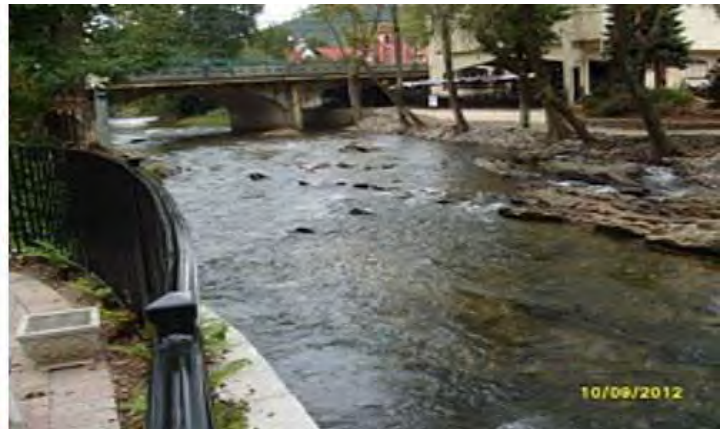
Along Main Street and the Chattahoochee River in Helen, Georgia