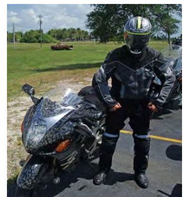
Lovebugs are here to stay. Get used to them!!

Amazingly enough, the Lovebug's life cycles is linked with celestial seasonal cycles of Earth. Adult Lovebugs die after their late summer breeding season, but their young live on. New small larvae will emerge as adults after the spring equinox. If we are fortune enough to have a few cold fronts pass through the Sunshine State or a low amount of rainfall, it may reduce the birth rate of the bugs, so we may experience a bit fewer on our roadways. Unfortunately, they're not limited to appearing in large numbers not only in spring, but also in late August and September during their mating season, but in smaller numbers, usually.