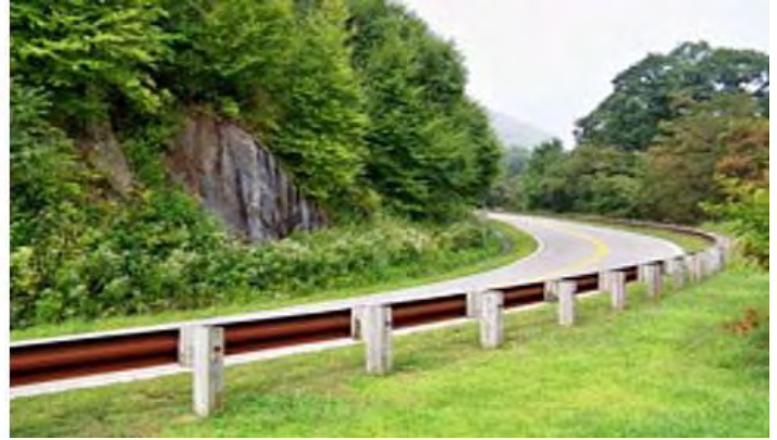
On the Cherohala Skyway

On Monday we headed east through Clayton, GA and across War Woman Road to NC 28 , which hyper twists up into Highlands, NC. US 64 took us further east through Cashiers to NC 215, which twists and turns and twists some more as it climbs steeply north to the Blue Ridge Parkway (BRP) above Rosman. The BRP is one very special mountain 2-laner, which we took west (south) toward Cherokee. We eventually made it back to the NOC for chili before returning to Helen.