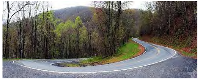
One of the many switchbacks along Wayah Road

Past Nantahala Lake to US 74, which follows the Nantahala River’s rapids east to the River’s End Restaurant at the Nantahala Outdoor Center (NOC) , we met more good friends whom we hadn’t seen in years and got caught up over some really terrific food and views of the kayakers and rafters plying the white waters below us.