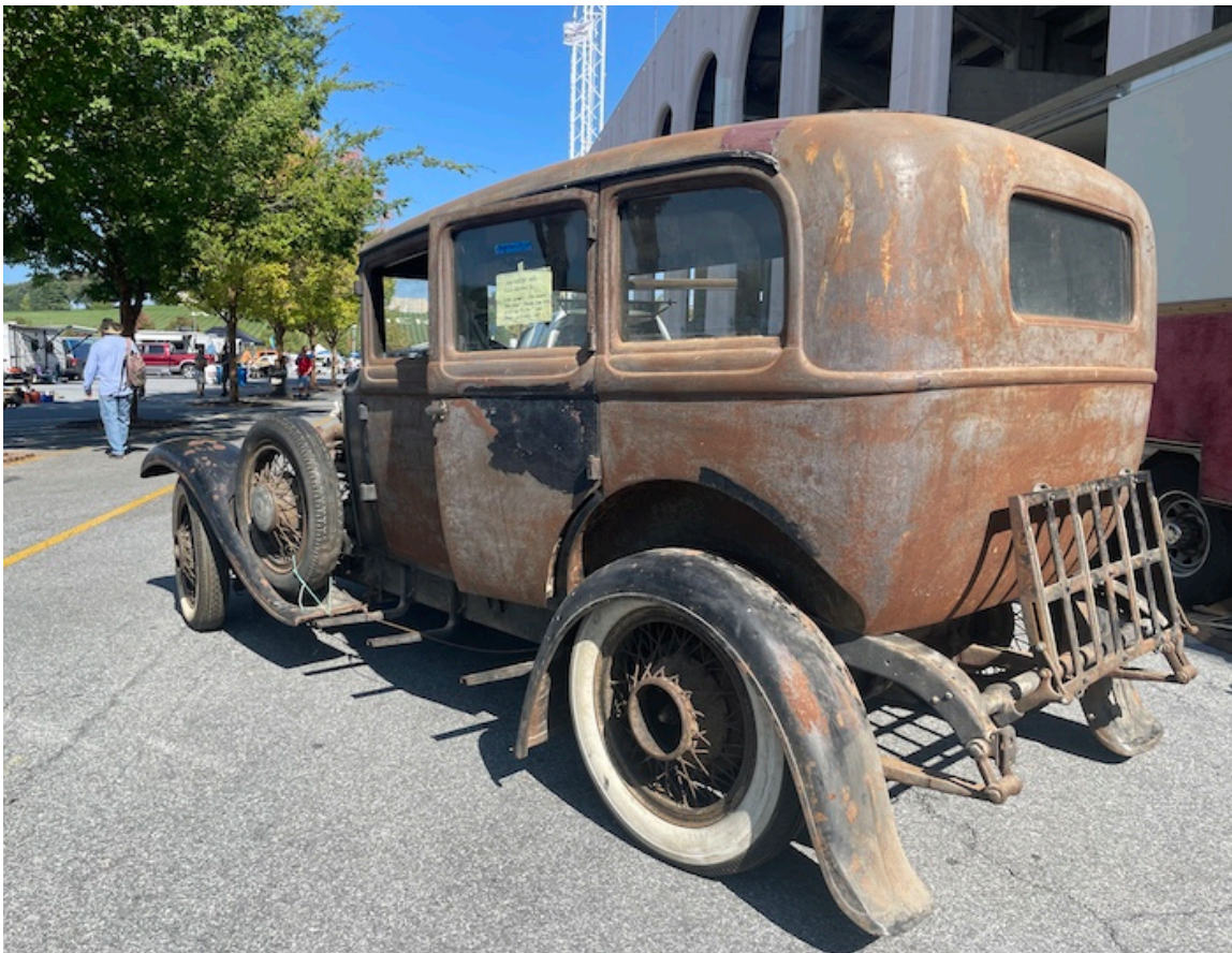
A 1930 Nash 400 Twin Ignition 6 at the AACA Fall Nationals