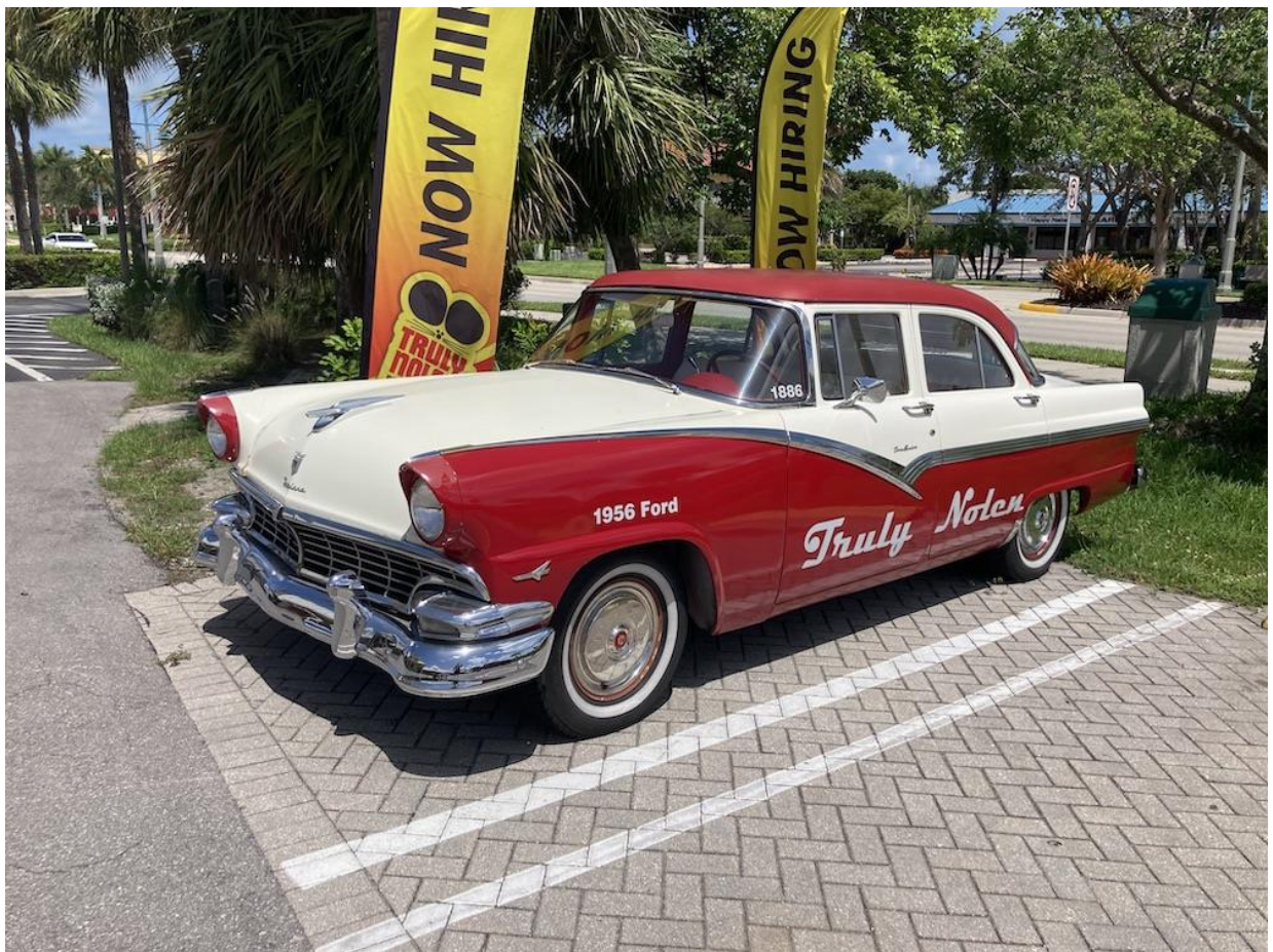
1956 Ford Fairlane at Truly Nolen business in Marco Island