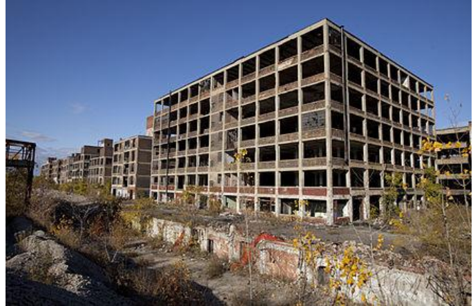
Packard Automotive Plant in 2009