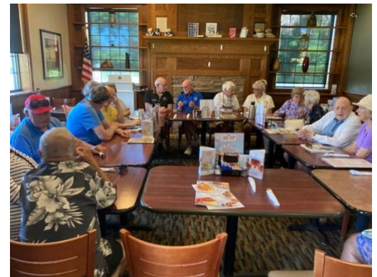
July luncheon at Perkins

The August (and final for the summer) AACA Luncheon will be held at Perkins on August 14 at 12 noon, 3585 Gateway Ln., Naples (near I-75 and Pine Ridge Rd.).