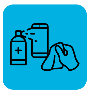
Disinfect surfaces and objects

Workers have the right to refuse unsafe work. If health and safety concerns are not resolved internally, a worker can seek enforcement by filing a complaint with the ministry's Health and Safety Contact Centre at 1-877-202-0008 .