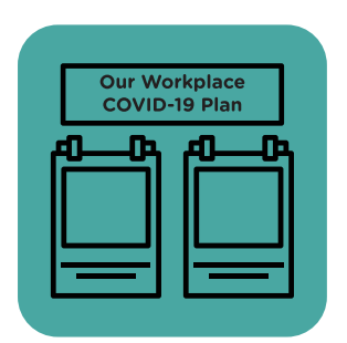
Make a Covid-19 safety plan