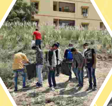
15 Feb 2019: Tree Plantation at Nizampet Lake by DCB Bank, Hyderabad