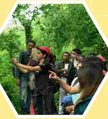
21 Sep 2019 : Monsoon Trail at Karnala Bird Sanctuary, Standard Chartered Bank