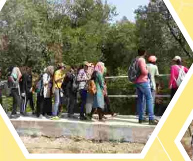
20 Mar 2019 : Mangrove walk at Aroli Mangrove Centre

17 Mar 2019 : Creekwatch in Talawe, Nerul