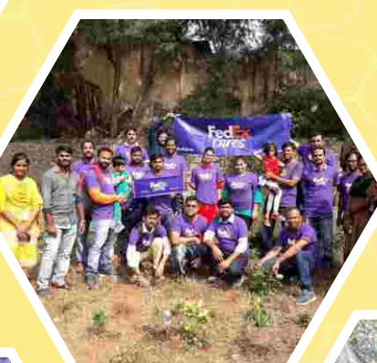
7 Dec 2019 : Butterfly Garden at Government High School, Telangana, United Way Mumbai