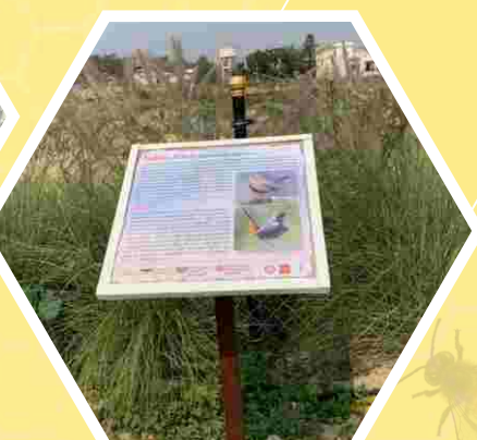
18 Feb 2019: Development of Signage for Lake Education, Nizampet Lake, Hyderabad for Wells Fargo India Solutions Pvt Ltd.