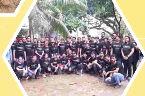
12 Dec 2019: Clean Up Drive at Nizampet Lake, Goodera, Hyderabad