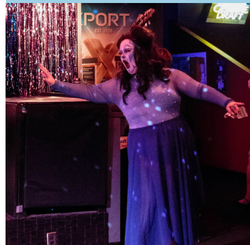
Dirt from the Ground

“These thoughtful choices injected a quasi-subversive quality into the entire show for which one can only imagine the Wunderkind cackling with glee.”