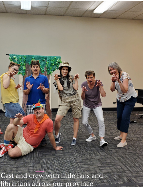
Cast and crew with little fans and librarians across our province

Highlights included a featured performance at the Blueberry Jam Outdoor Stage in Flin Flon, a stop in Swan River for 133(!) parents and children, and a show in Ericksdale for 43 people. Ericksdale has a population of 800 and I'm grateful that 5% of the town all spent their afternoon with us.