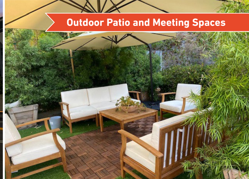
Outdoor Patio and Meeting Spaces