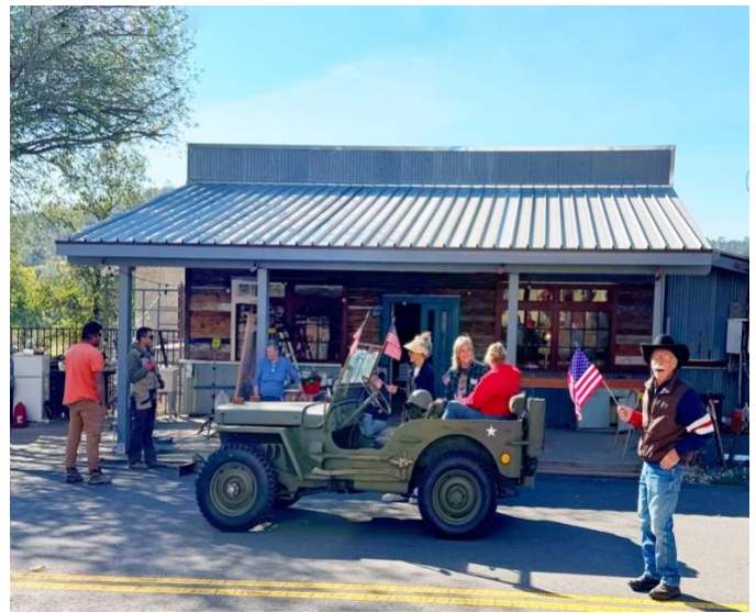
Enjoying snacks and fellowship after the parade, as well as the hospitality of the future Smartsville Salvage & Sundry