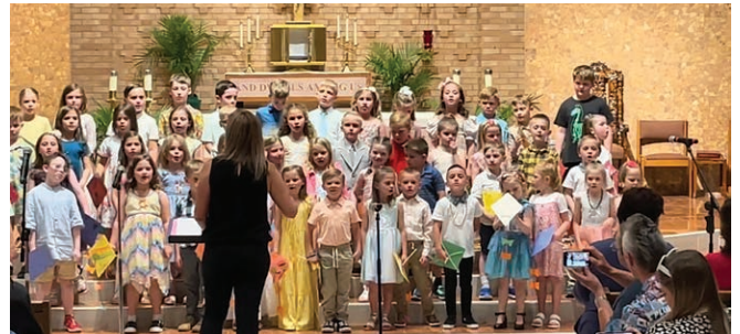
SJS students participating in their weekly music class