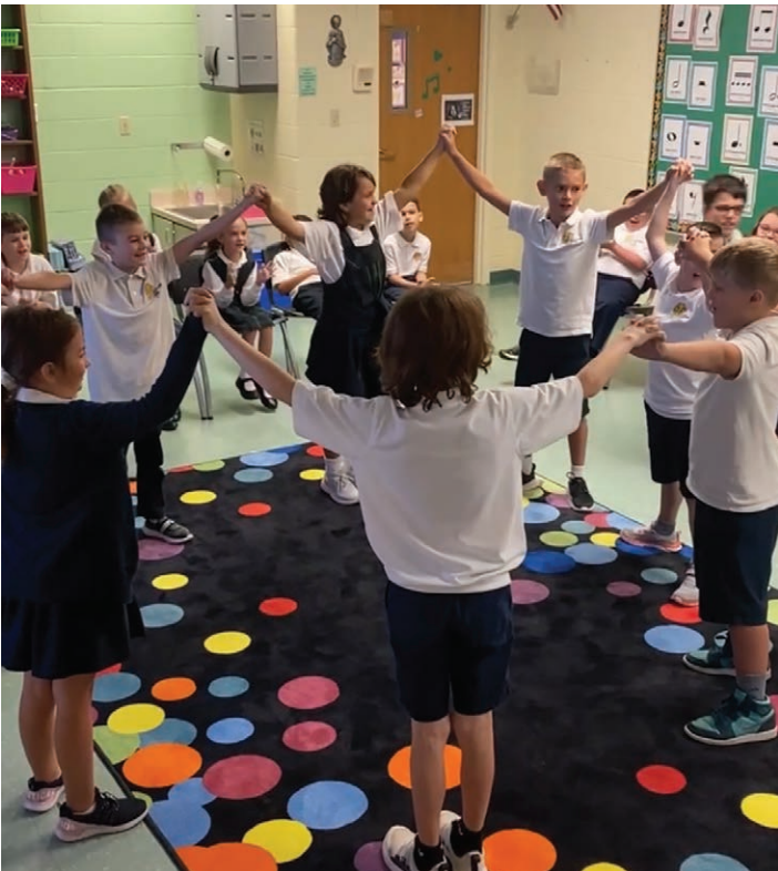
SJS students participating in their weekly music class