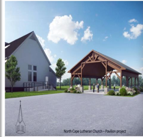
North Cape Lutheran Church - Pavilion project