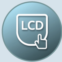
Smart Touch Controller