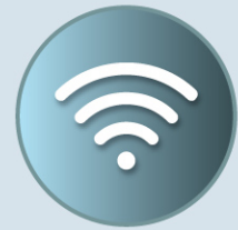
Smart WiFi Control