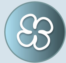
DC Brushless Fan Motor