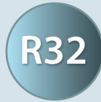
Low GWP R32 Refrigerant