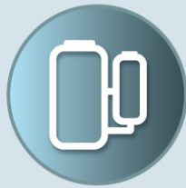
Stepless Twin-Rotary Inverter Compressor