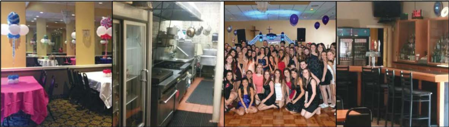
Hewitt Square, East Northport, NY 11731 | www.frjudge.org