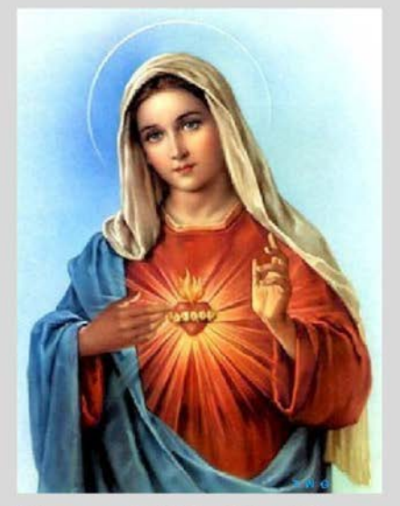
Blessed Virgin Mary