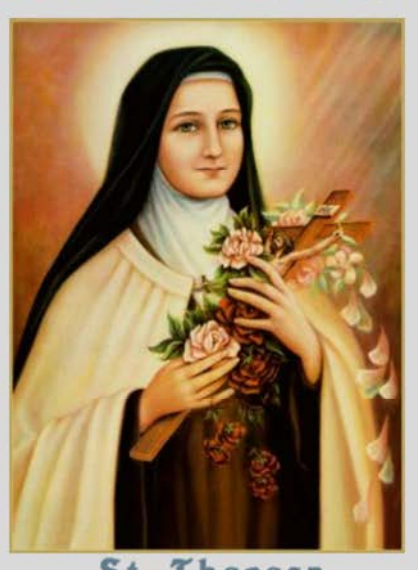
St. Theresa the Little Flower