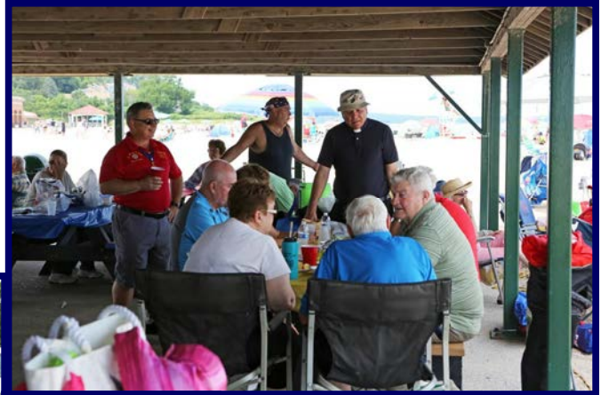
Below, the chefs take care of the business of the day.