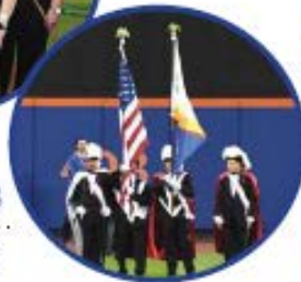
NYS presenting the Colors at the 2018 Mets game

THERE WILL BE A PUBLIC SERVICE ANNOUNCEMENT PROMOTING THE KNIGHT OF COLUMBUS & THE KNIGHTS WILL PRESENT THE COLORS DURING THE NATIONAL ANTHEM