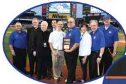
NYS Knights of Columbus receiving the Spirit Award 2018