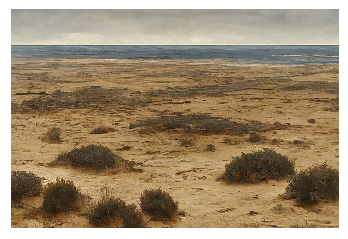
Page 3 of 5