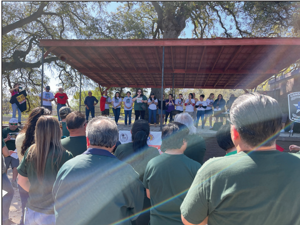
AFSCME members gather at Parque Zaragoza on March 26 to celebrate the legacy of César Chávez and hear the announcement of Local 1624's "$22 in '22" living wage campaign.

members and calls to action. Members shared with Council their stories of struggling to survive amid increasing demands at work and an historic rise in the cost of living in Austin and surrounding areas.