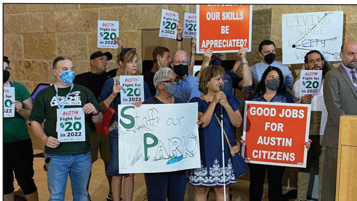
Local 1624 members rally with City Council members Aug. 18 after Council approves the $20 living wage amendment.