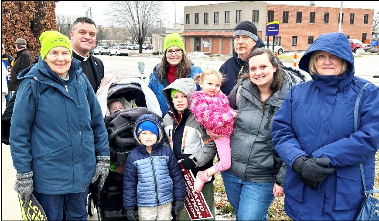
Life Conference and March to the capital in Topeka. We joined 125 Lutherans and over 2500 others who marched to the capital and greeted by KS Legislators.