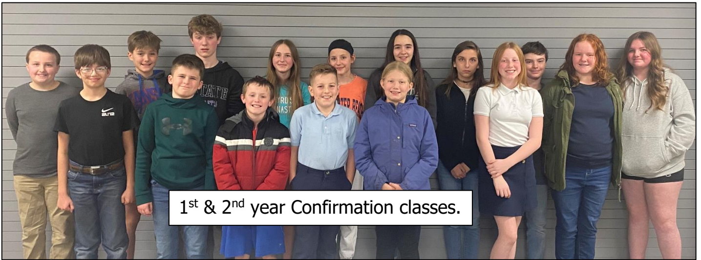
1 st & 2 nd year Confirmation classes.