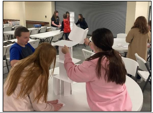
Annual Confirmation Retreat. We go from 6 pm to midnight with chapel services, team building games, open gym, and catechism studies.