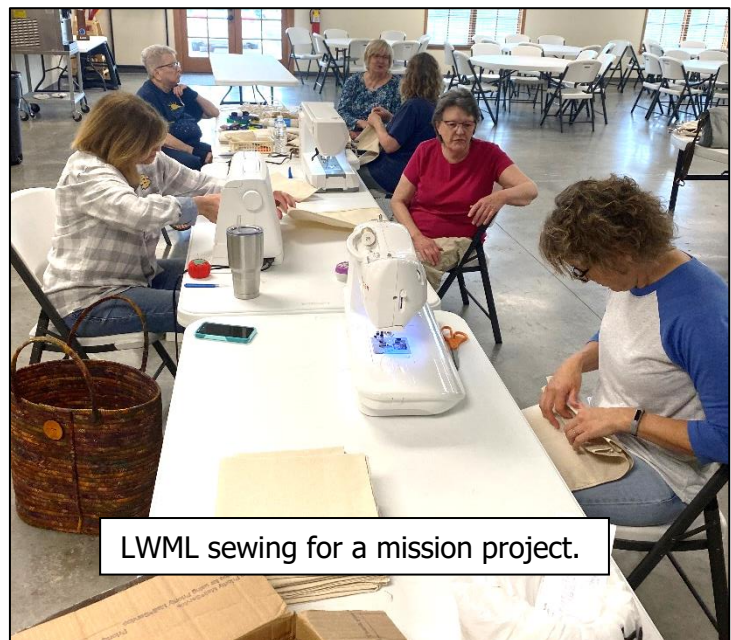
LWML sewing for a mission project.