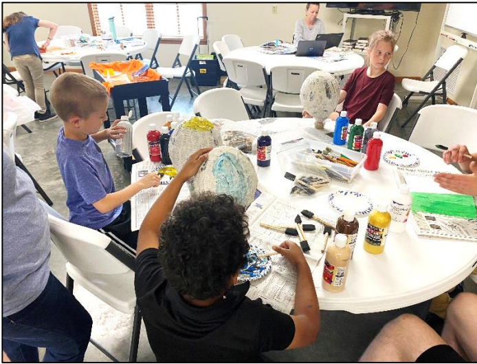
Art at the Academy