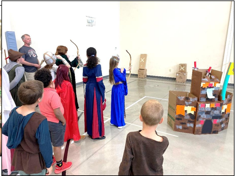
Middle Ages Day at our Academy included archery, special art projects, medieval meal, games as most kids came in special dress.