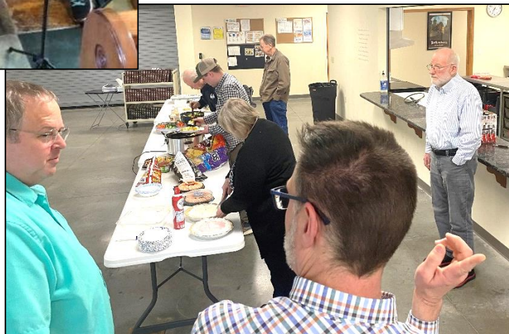
Monthly Book of Concord study for all, last Sunday of the month. Join us anytime as we engaging doctrine for about an hour and conclude with a spread of foods and variety of beverages.