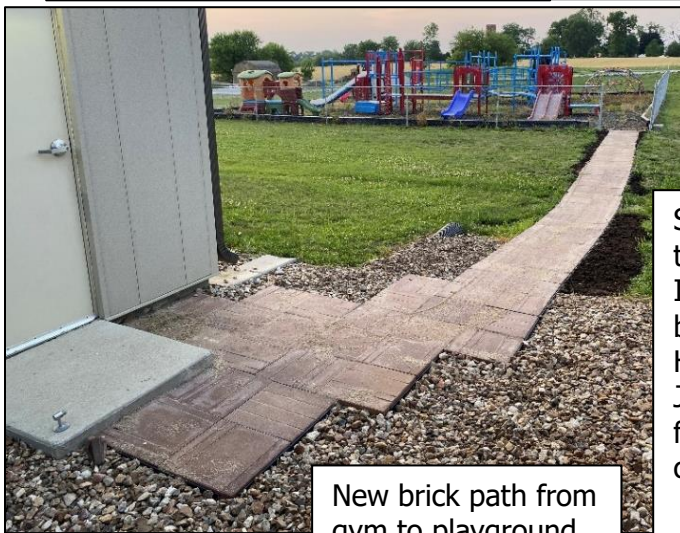
New brick path from gym to playground replaced the rock.