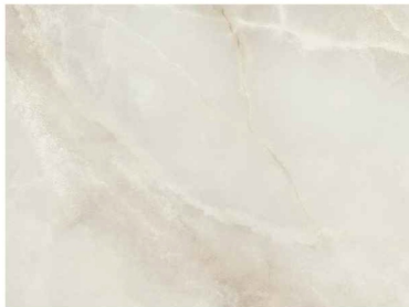
Carrara Onyx Grey