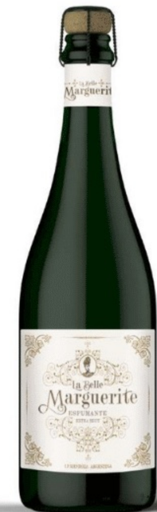
EXTRA BRUT PINOT NOIR - CHARDONNAY