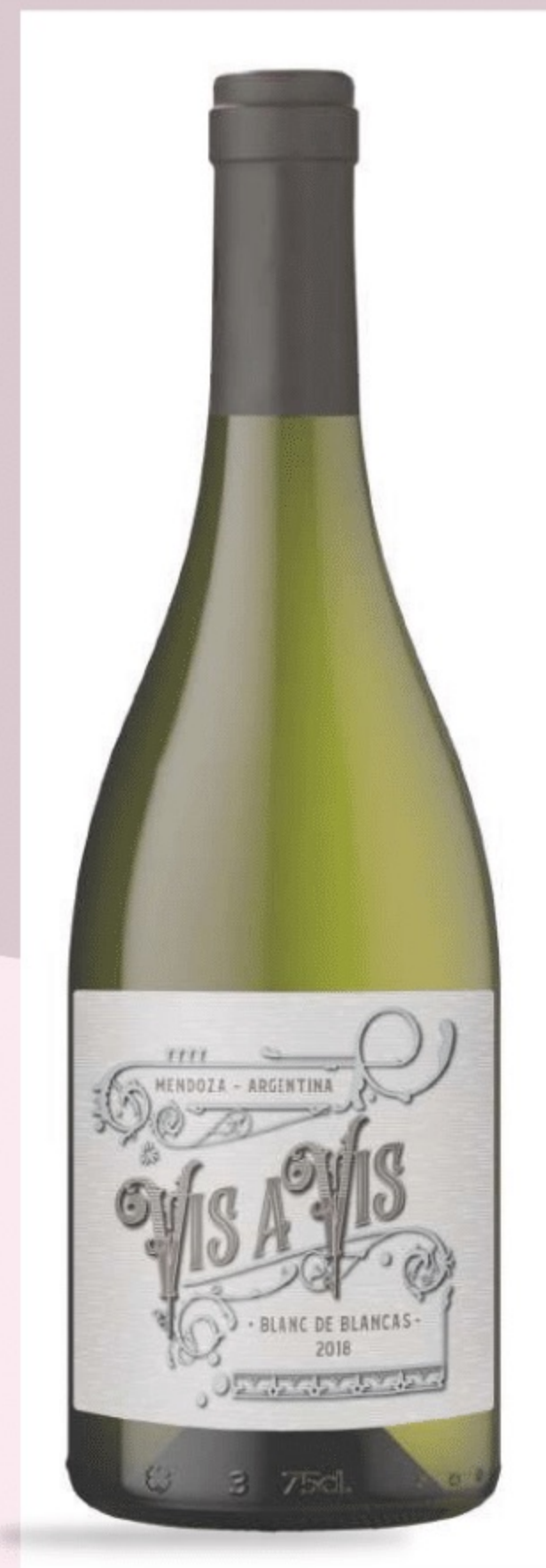
BLANC DE VIÑAS VIEJAS