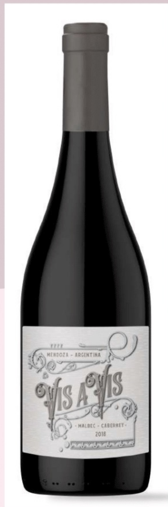
MALBEC CABERNET SAUVIGNON