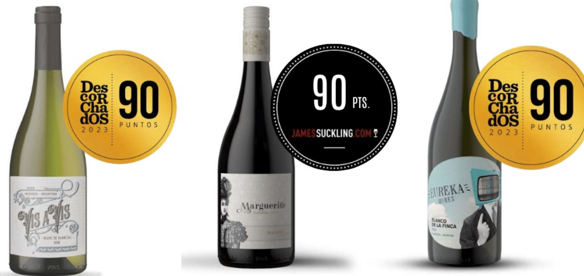
VIS A VIS Ugni Blanc, Pedro Ximénez, Torrontés, Maticha, Gibi