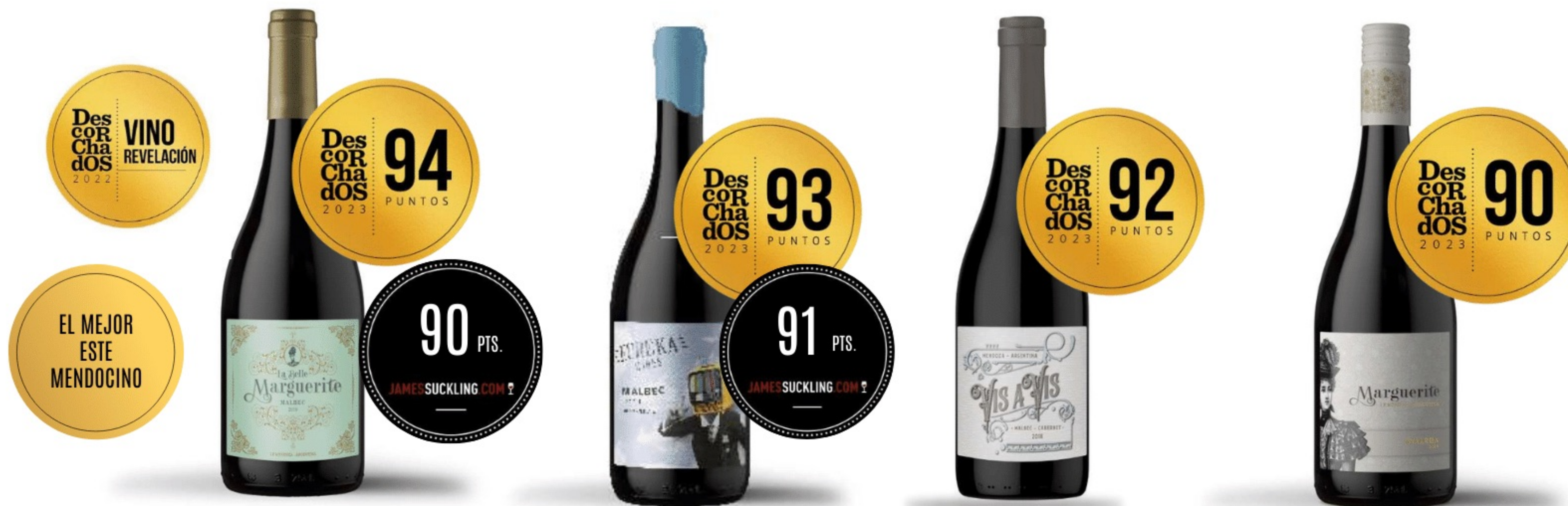
LA BELLE MARGUERITE Malbec