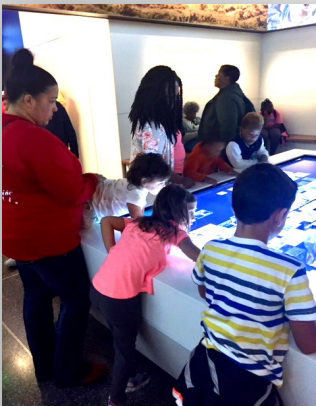
Interactive exhibit at the National Museum of African American History and Culture