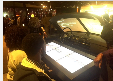
Interacting with the Negro Motorist Green Book . National Museum of African American History and Culture

LIA serves as a resource organization using technology, culture, public history, and education to bridge communities. We promote and develop interactive and interpretative programming through use-inspired research and civic engagement.