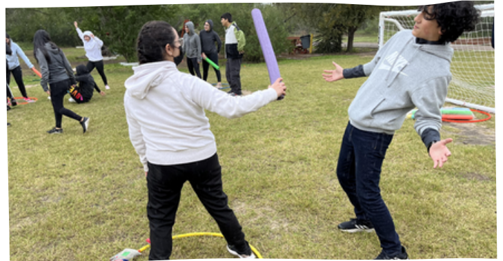
Bee - A - Pollinator