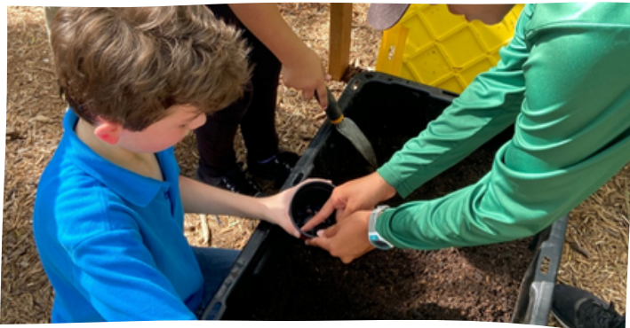
Jr. Green Thumbs