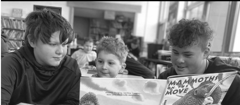
Our Lady of the Lake preschool students are all smiles when their 5th and 6th grade Reading Buddies visit.

Our Lady of the Lake is an equal opportunity employer.