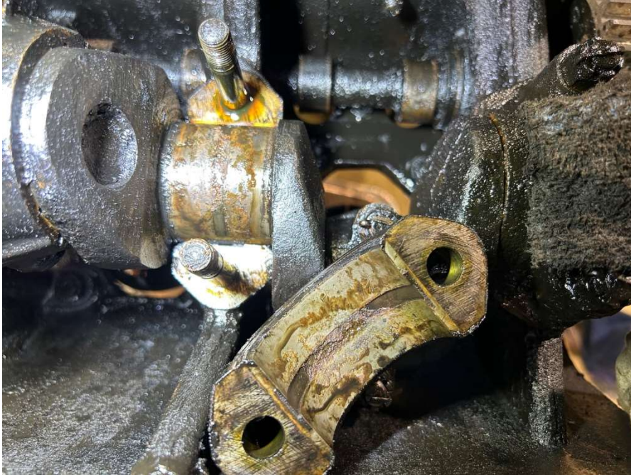
Caption: Years of condensation cycles rusted the surface of all the main journals.