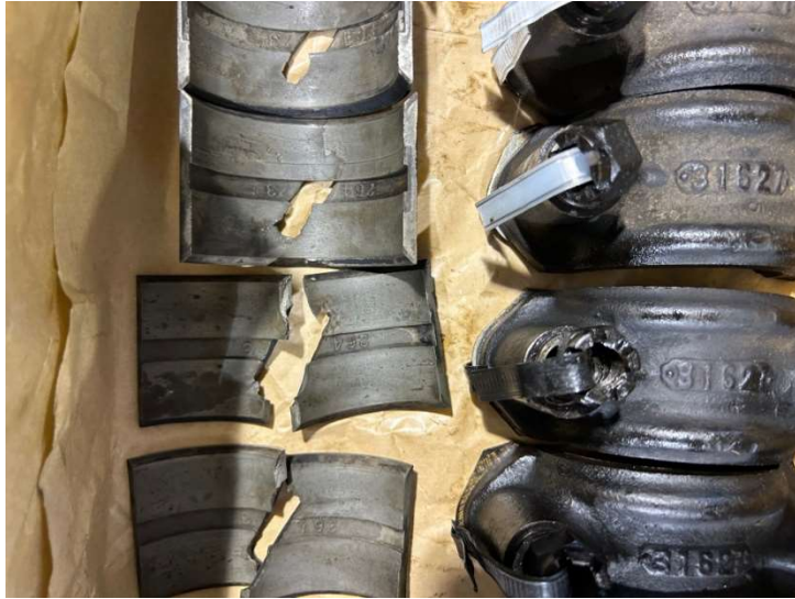
Caption: Main bearings. Note damage to upper babbitt bearing shells due to the weakness of the oil gallery relief.