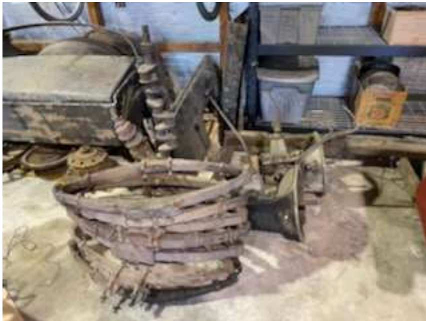
Caption: Various Franklin parts: Leaf springs, rear trunk, crank shaft, clutches, flywheels, two transmissions, rear fenders...