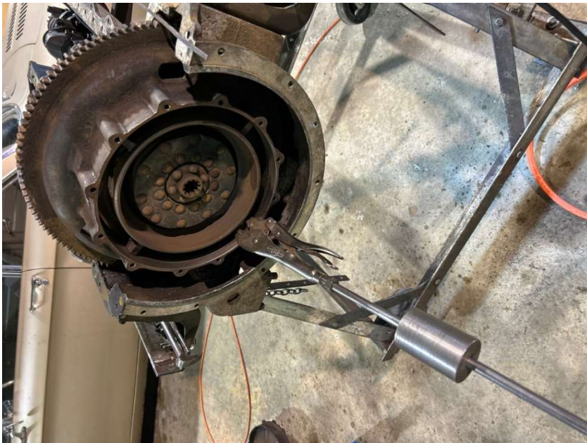
Caption: Pulling thrust ring out of flywheel housing.