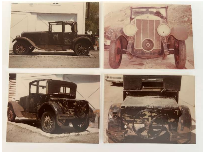
Caption: 1925 Franklin 11A, Babcock Bodied Coupe (pictures circa 1979 before it was disassembled)

I'm now working on inspecting the steering assembly, cleaning up the leaf springs, and will likely tackle the wood sills next. I'll provide more updates as the project continues.