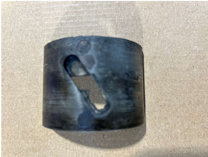
Caption: Center main bearing-solid babbitt (die cast). Note: Oil gallery relief 'cut/cast' diagonally on the back side to allow oil from the oil gallery supply in the crankcase at the edge of the bearing to the center of the bearing.