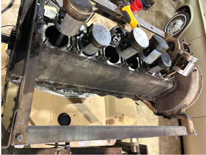
Caption: Air Cooled Engine, all cylinder assemblies removed