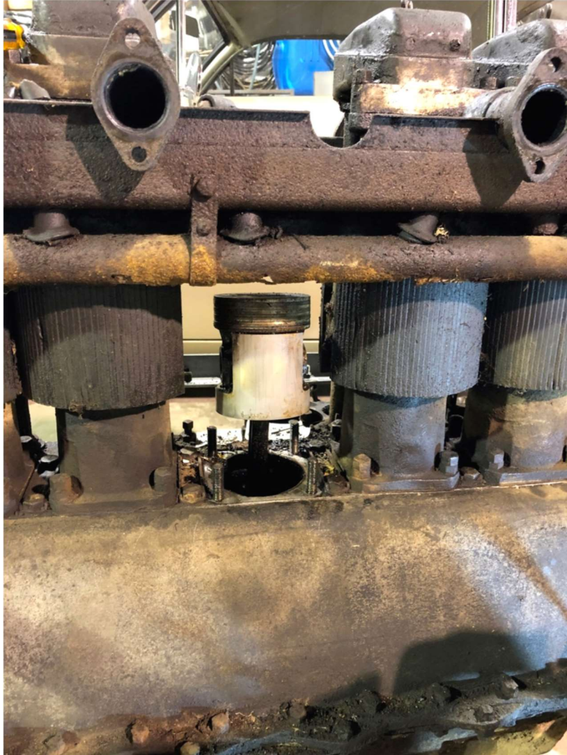
Caption: Franklin Air Cooled Engine, one cylinder jug removed.