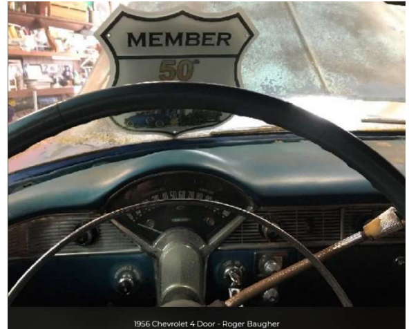
1956 Chevrolet 4 Door - Roger Baugher

We do still need your help at the Car Show by contacting your sponsors, spreading the word about the show (see previous emails with an e-flyer attached), planning to bring your car, and attending/judging if you feel safe to do so. Be thinking, now, if you do not feel comfortable assisting and let Tom Winters know at 719-660-9012 or thomaswinters2003@msn.com , as soon as possible. If you cannot assist during the event because of coronavirus concerns, we certainly understand, but you