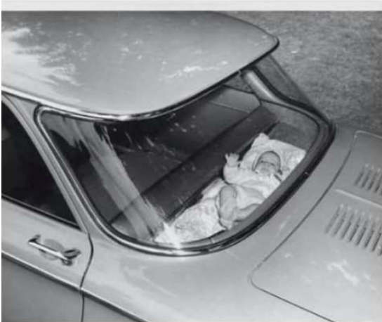
The 1960 Corvair dash baby cradle. – A safe, comfortable way to carry your baby before car seats were even a concept... warmest place in the car, it has a rear engine, and the engine vibrations lulls the baby

about the Corvair, but it was only the first chapter, “The Sporty Corvair”, that focused on the Corvair and its quirks. The rest of the book talked about metal dashes, non-collapsing steer wheels, seat belts, tire pressure, hood ornaments, etc.