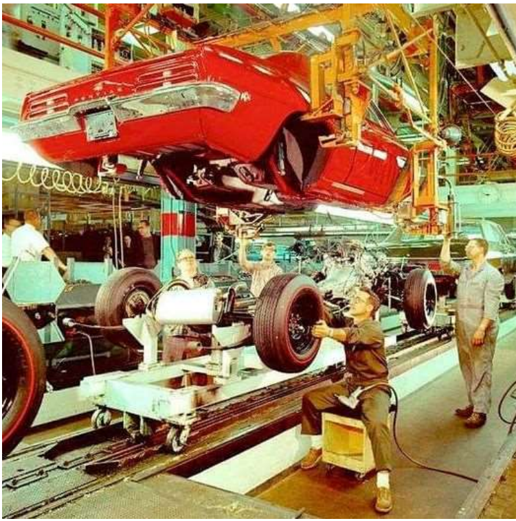
Oh how times have changed.