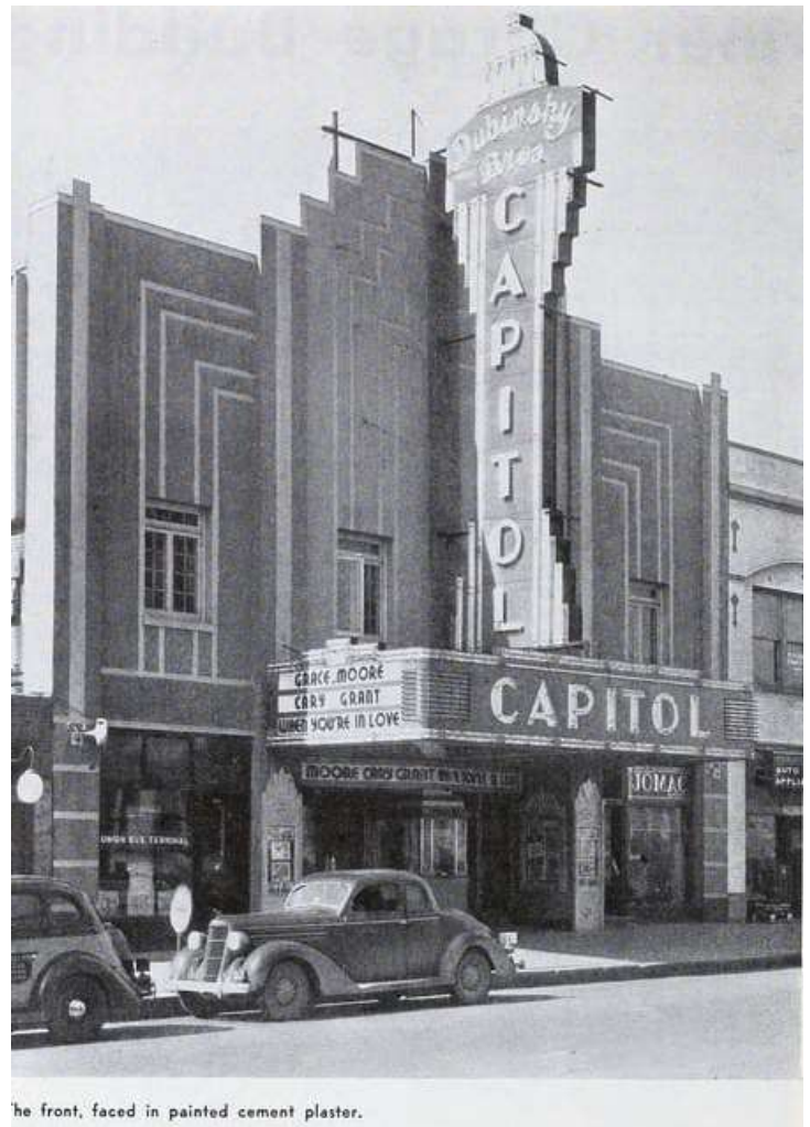
The front, faced in painted cement plaster.

We have T-shirts in gray and white, collared polo-type shirts, and a humorous T-shirt addition. If your shirt looks dingy, time to upgrade! Shirts available at future meetings and events. $20 for collared shirts. $15 for t-shirts. $10 for hats. Contact Jim Martin at 573-864-4048.