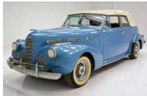
1940 LaSalle Convertible Sedan ...