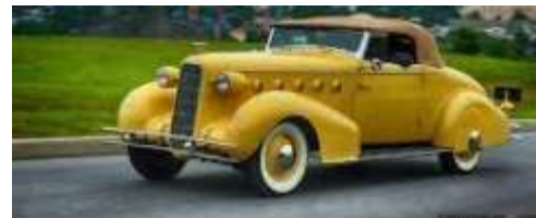
1934 LaSalle Series 350