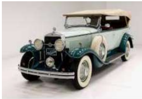
1930 LaSalle Phaeton 7 Passenger ...

LaSalle was an American brand of luxury automobiles manufactured and marketed, as a separate brand, by General Motors' Cadillac division from 1927 through 1940. Alfred P. Sloan, GM's Chairman of the Board, developed the concept for four new GM marques brands - LaSalle, Marquette, Viking and Pontiac - paired with already established brands to fill price gaps he perceived in the General Motors product portfolio. Sloan created LaSalle as a companion marque for Cadillac. LaSalle automobiles were manufactured by Cadillac, but were priced lower than Cadillac-branded automobiles, were shorter, and were marketed as the second-most prestigious marque in the General Motors portfolio. LaSalle's were titled as LaSalle's, and not as Cadillacs.