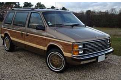
1986 Plymouth Voyager LE

The first-generation Chrysler minivans are a series of minivans produced and marketed by the Chrysler Corporation in North American and Europe from 1984 to 1990. Sold in both passenger and cargo configurations, the series is the first of six generations of Chrysler minivans. Launched ahead of chief competitors Chevrolet Astro/GMC Safari