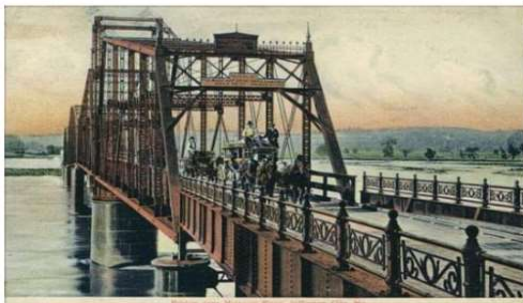
First bridge over the Missouri River at Jefferson City