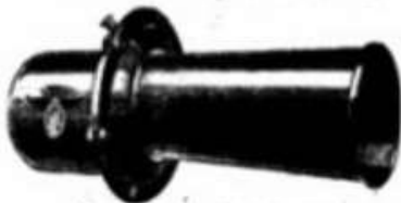
Stewart Warning Signal Model 163 $6.50

PROTECT your Ford, both front and rear, with Stewart Autoguards. The models listed on left fit both open and closed cars.