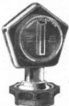
Stewart Warn-O-Meter Model 173-B $10

PUT a real Stewart Motor-Driven Warning Signal on your Ford. Don't risk your own safety and endanger others. Is complete with bracket, wiring and push-button. $6.50.