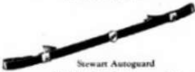
Stewart Autoguard Model 158-E, front . . . $11 Nickel rail . . . . . 13 Model 158-K, rear, black enamel $11 Nickel rail . . . . . 13

NEW MODEL Stewart Speedometer for your Ford car. Tells you when and where to lubricate by the means of colored dials. Tells you your speed. Records your mileage. Sells at same price as old model. $15.