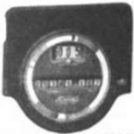
Stewart Speedometer Model 160-K or Ford cars $15 Warrant Price $15.50

NEW MODEL Stewart Speedometer for your Ford car. Tells you when and where to lubricate by the means of colored dials. Tells you your speed. Records your mileage. Sells at same price as old model. $15.