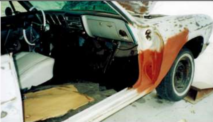
Front dog leg and door pillar area with metal panel patches welded in (red primer area) 20011965 Corvair Monza 'restored' November 2012

significant area of rust was the rear wheel wells where the inner and outer body panels are spot welded together. Basically it all rusted away around the edges. In the late 1990s I repaired the left side wheel well area by welding metal to make the repair. The issue with that method was there are many compound angles in the wheel well and I had to 'excessively' skim coat the repair and it took hours of work. In the early 2000's I took a different approach to the right side rear wheel well. I purchased a