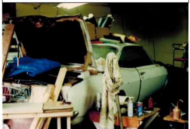
Corvair after bringing it home from the salvage yard in 1988 (engine lid required replacement)

I tried to get the Corvair engine started but the starter would just make the dreaded 'chezzzzz' sound of the starter gear grinding out on the torque converter ring gear. I removed the starter to find a very ground down ring gear on the torque converter. I was able to turn the engine freely but it would 'lock' about half way