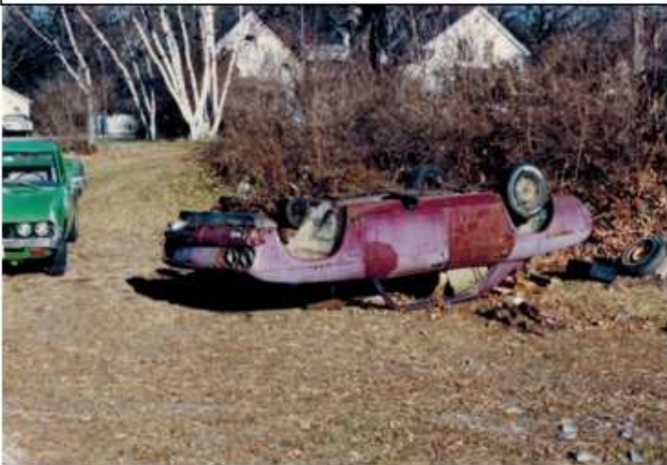
Parts car inverted for donated parts Circa 1988 (Grandpa Hall's Datsun 620 Pickup in background)

put it all back together and got the engine working for less than $300. Since my Dad had the 1966 parts car, I decided to swap out the Powerglide for the parts car's three speed and salvaged all of the manual transmission components cables pulleys etc... and converted the 1965 Monza to a three speed manual. I did this rather than replace the torque converter in the high mileage Powerglide (of unknown condition). That arrangement worked pretty well for a while. I taught my middle brother Josh how to drive a manual transmission in this car in a parking lot at a local factory.