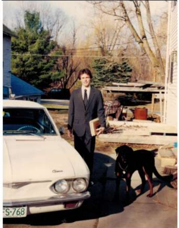
Me with the 1965 Corvair Monza circa 1990, Claremont, HN.