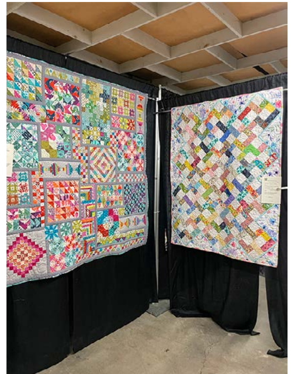
At the 2022 Quilt Show

The first quilt show meeting was on January 31st. We will continue to meet every other month until Aug. when we switch to monthly meetings.