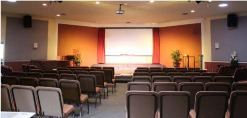
General meeting space

Beginning with our June (Community Sew) guild meeting, we will be meeting at the Center for Spiritual Living at 14 Hillary Lane .