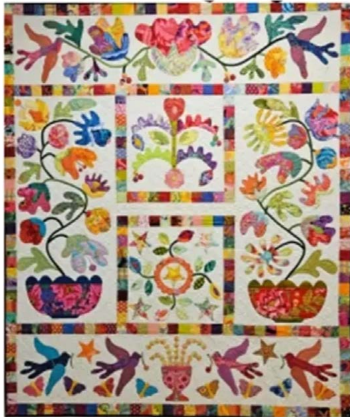
Birds and Flowers

Silver Dollar Fairgrounds • Chico, California