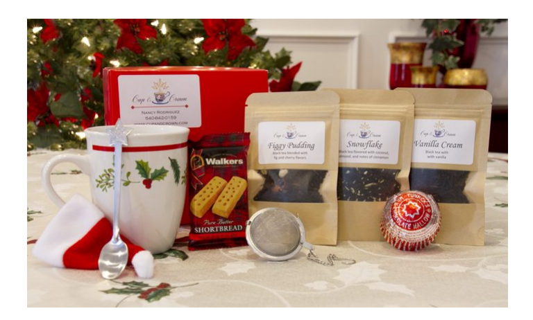
Cup & Crown Holiday Special-Tea Gift Boxes are almost sold out! This gift box includes delicious teas and treats to warm the recipient through the winter. It's a great present for...teachers, college students, grandparents, mom & dad, neighbors, caretakers, you! Place your order today before they're all gone. <a href="http://www.cupandcrown.com">http://www.cupandcrown.com</a>

Last year's virtual auction was such a fun event, we've decided to hold it again this year. The auction will take place in March, however we are currently collecting tax deductible donations for items or services to be auctioned. If you would like to contribute please <u>CLICK HERE</u>.