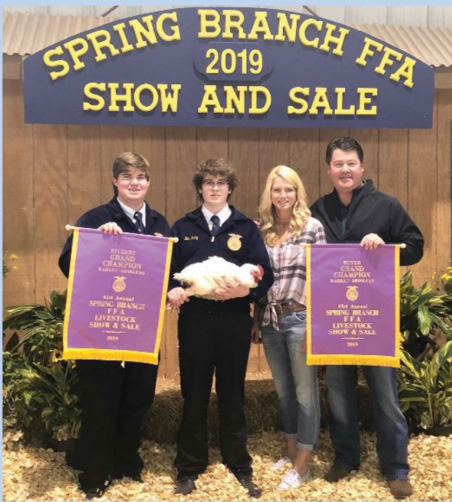
SBFFA Grand Champions