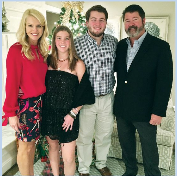
Goodson Christmas 2019