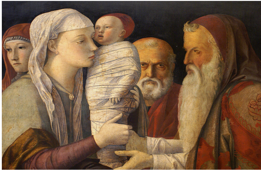
Presentation at the Temple by Giovanni Bellini (Note the Christ Child in Swaddling Bands)

sarcophagus. The child would have looked dead, but he was breathing and alive! This was the sign to the shepherds. Further, a manger is a feeding trough. The use of a manger for a crib for the infant Jesus was itself prophetic. Even in his birth, it was foreseeable that in some sense he would be “fed upon,” a truth he would make known by his death whereby his body was broken to give the Bread of Life to the world.