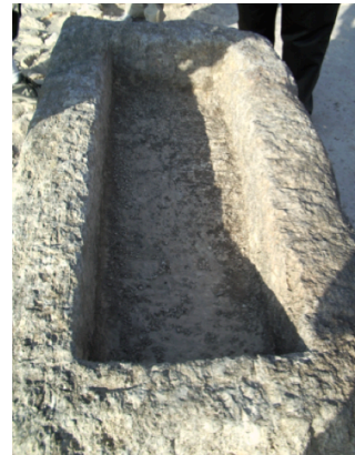
Mangers from the Stables of Ahab in Megiddo, Israel

Angels announce the sign appointed for the shepherds in the birth of Jesus. They are told that they will see the child wrapped in swaddling bands and lying in a rock-hewn manger. The shepherds hasten to see this sign. Imagine what they behold! They see an infant, mummiform in appearance, bound by the swaddling bands and lying immobile in a hollowed out block of limestone. But the infant child is very much alive! The shepherds then return to the care of their flocks, filled with wonder at all that has happened.