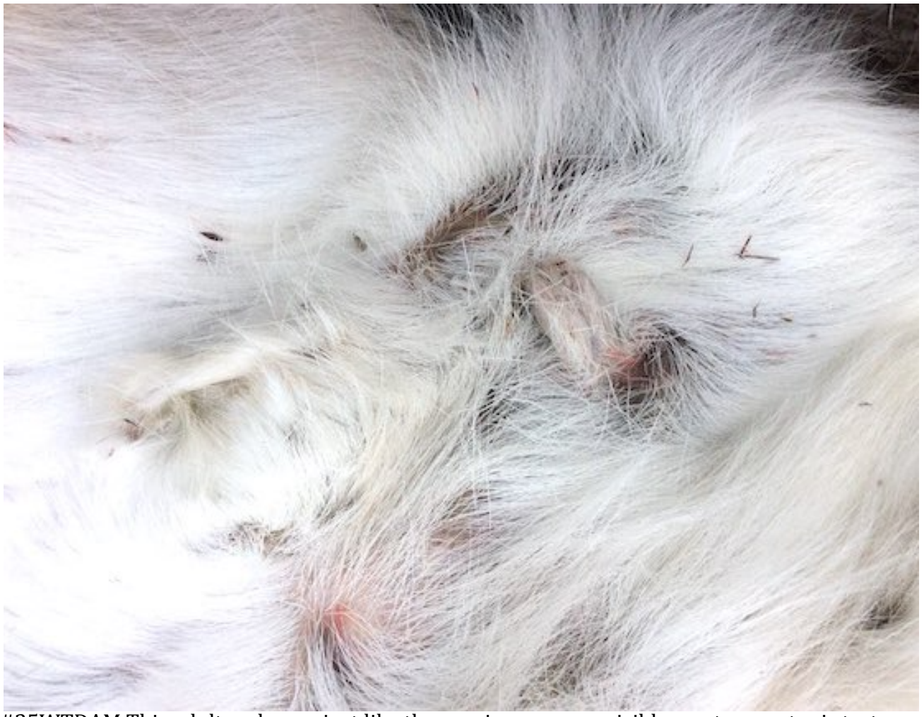
#25WTDAM This adult male was just like the previous one, no visible scrotum, ectopic testes and a shorter than normal penis sheath.