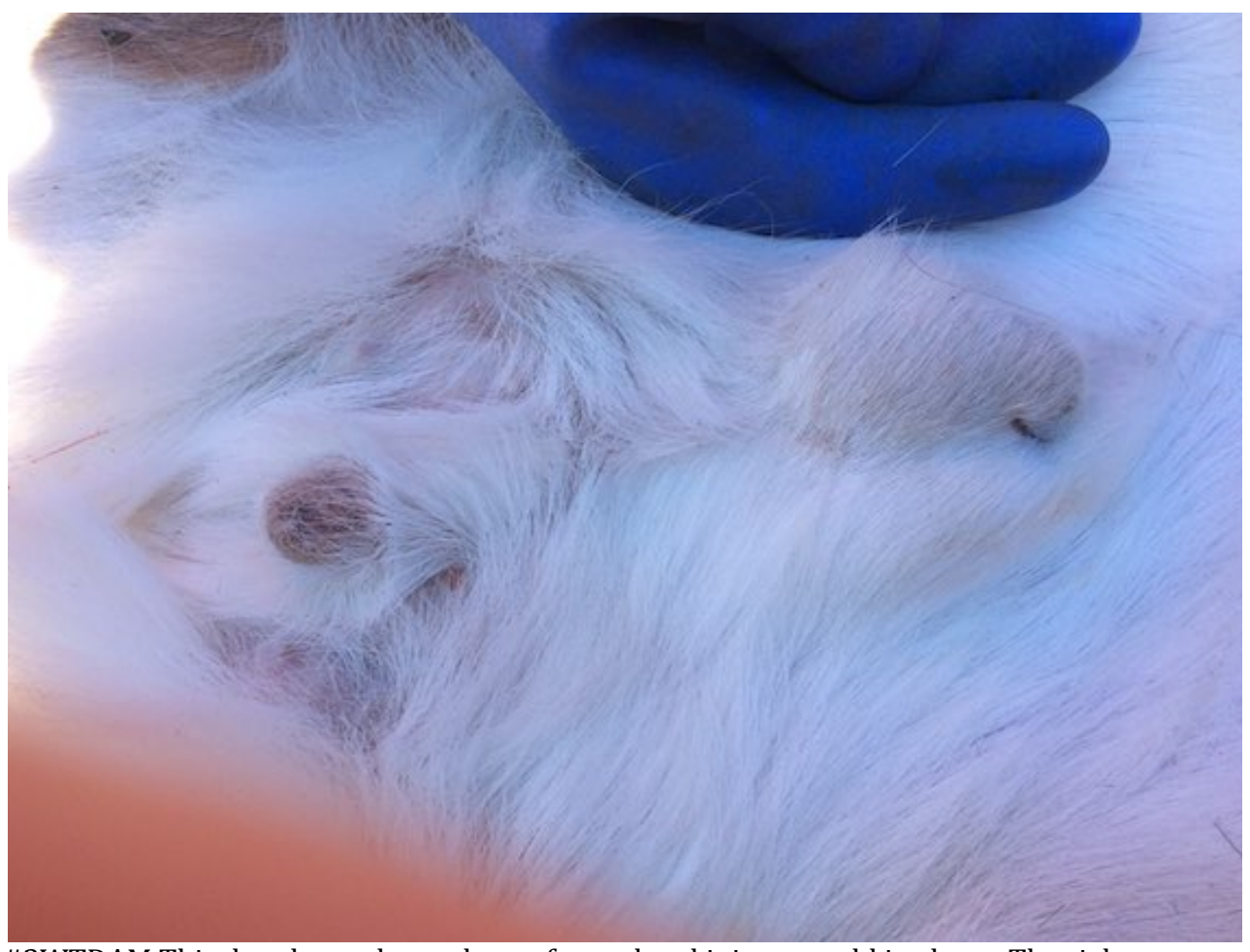
#3WTDAM This deer has only one bursa formed and it is very odd in shape. The right testes is completely ectopic and the penis sheath is very short.