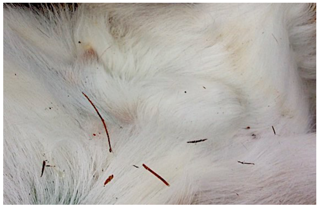
#8WTDAM This adult male has tipped back bursa forming a short bump with both testes ectopic. The penis sheath is longer than those in the previous photos.