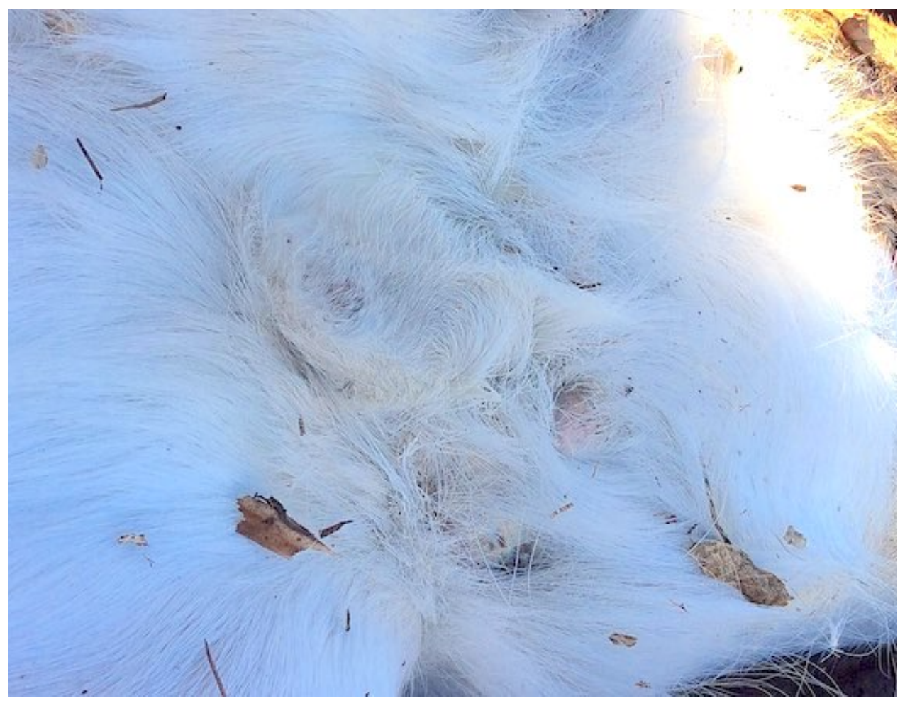
#15WTDAM This adult male was similar to the previous two with a slight bump and rough hair where the scrotum should have been. The penis sheath is so short that it is barely visible.