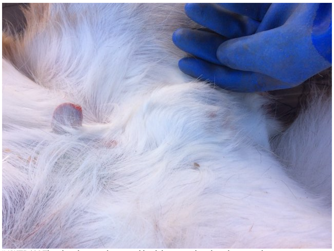
#1WTDAM This deer has similar tipped back bursa with a short bump and ectopic testes. The penis sheath on this deer is very short for an adult, even shorter than a normal newborn fawn.