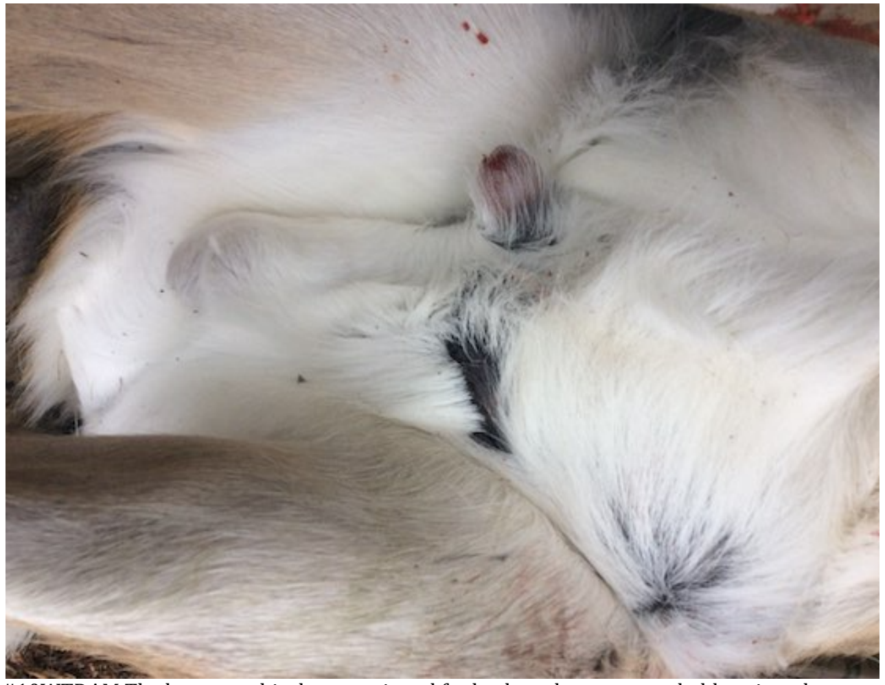
#10WTDAM The bursa on this deer are tipped far back so the testes are held against the body wall. The penis sheath is very short.