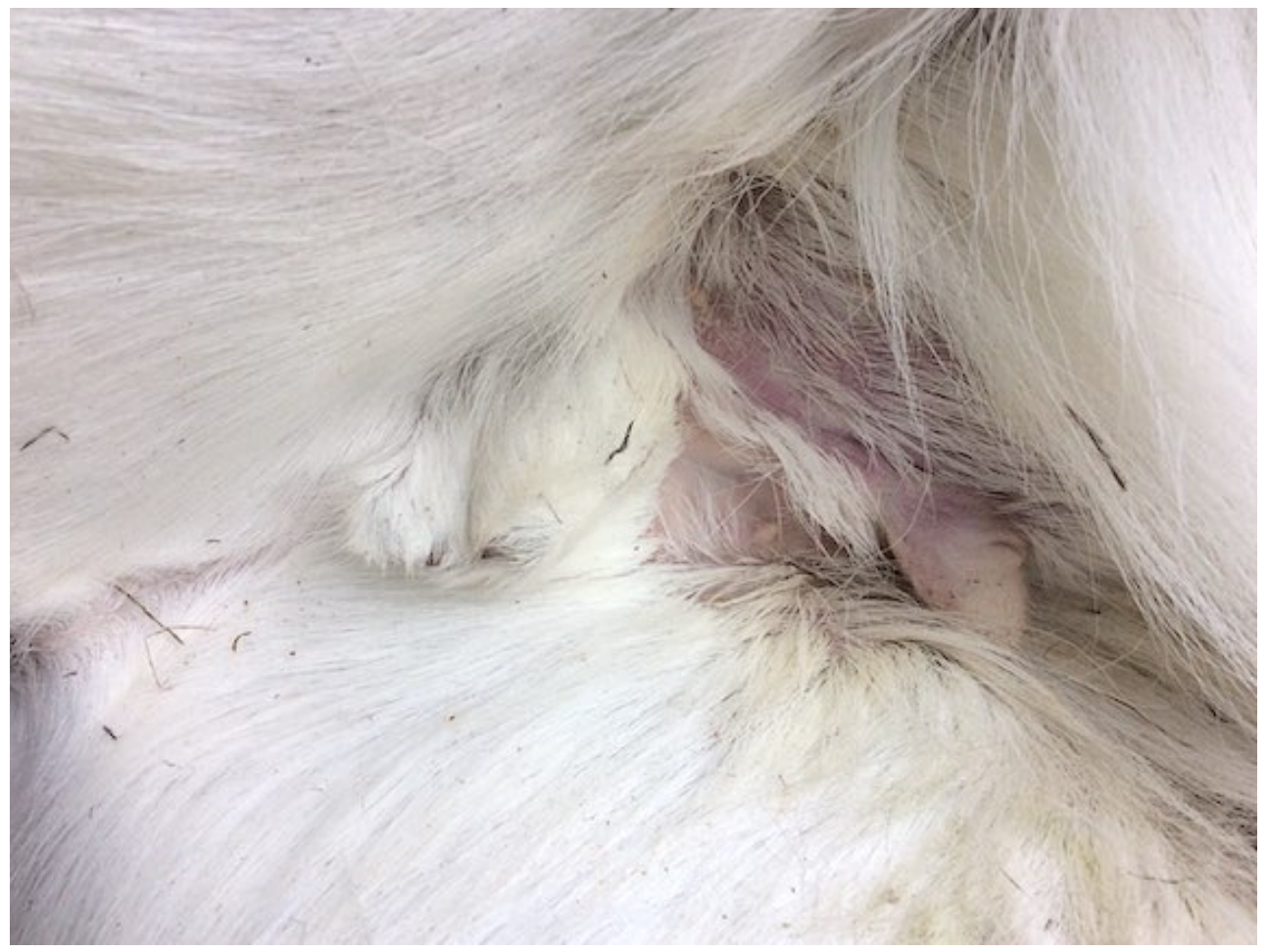
#24WTDAM This deer has two bursa with the left directly forward of the right. The right bursa is extremely short and the right testis is mostly ectopic. The penis sheath is short.