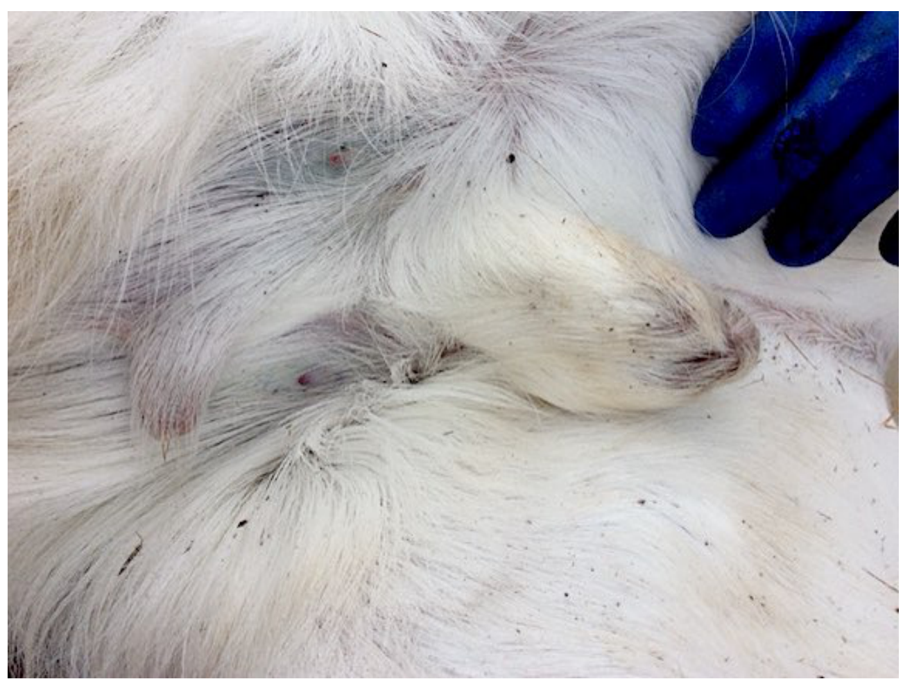
#12WTDAM Normal length scrotum with bursa which hold the testes away from the body wall. The penis sheath is somewhat short for an adult male WTD. A normal penis sheath on the external skin of an adult male WTD used to be between 5 and 7 centimeters (See photo by Judy Hoy above showing a normal penis sheath on an adult deer. The penis sheath on this deer is about 3 cm or half as long as normal.

These photos mainly illustrate some of the adult male white-tailed deer the Eagle Project team found with short bumps or no scrotum and consequent horizontal testes.