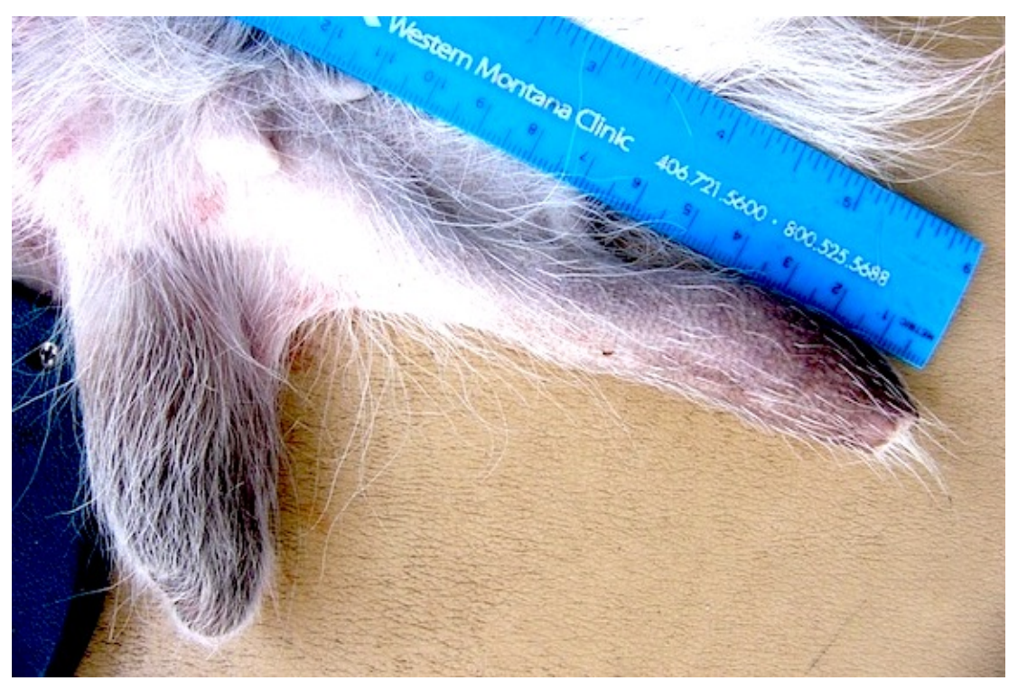
This shows normal adult white-tailed deer genitalia from the side. Note the length of a normal penis sheath which is close to 7 cm on the external skin of an adult male deer.

This is a close-up photo of a normal bilateral adult white-tailed deer scrotum being measured for length or distance down from the body. Note that this scrotum has a neck or narrower area between the bursa and the body, so the testes are contained completely away from the heat of the body wall. This photo is for comparison with the scrotums in the photographs below, except for the first photo, which has bilateral bursa, which appear to be normal in length or distance down from the body.