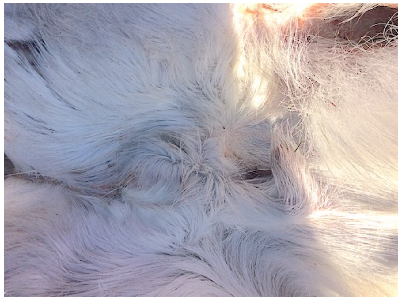
#5WTDAM This adult male had no visible scrotum and very short penis sheath.