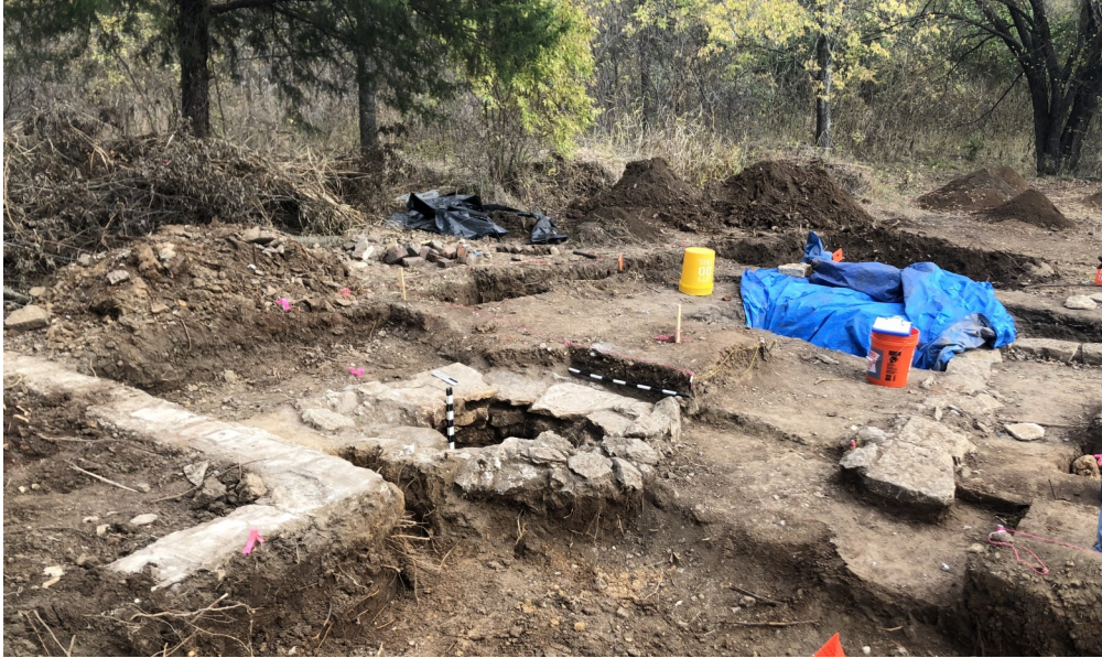
Sartin Hotel excavations.

Several NTAS members volunteered with TxDOT doing screening at the Sartin Hotel excavations in Bolivar.