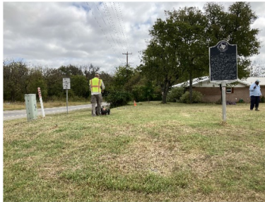
Archeologist operating a ground-penetrating radar at the Tom Cook Blacksmith Shop, where the "Bolivar" historical marker is located.