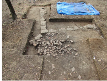
Overhead view of rock foundation of Sartin Hotel.