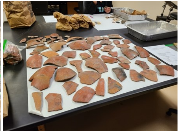
Left: Ray Wallace sorts through a bag of sherds that probably represent a single bowl.