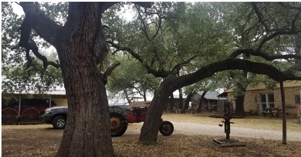
Figure 1. Bent tree is potential marker tree.