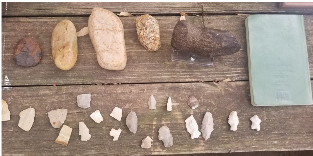
Figure 2. Part of the assemblage from pre-contact occupation at site.