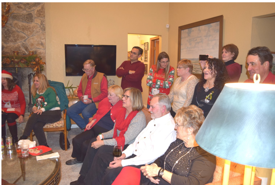
Several members enjoying the gift giving