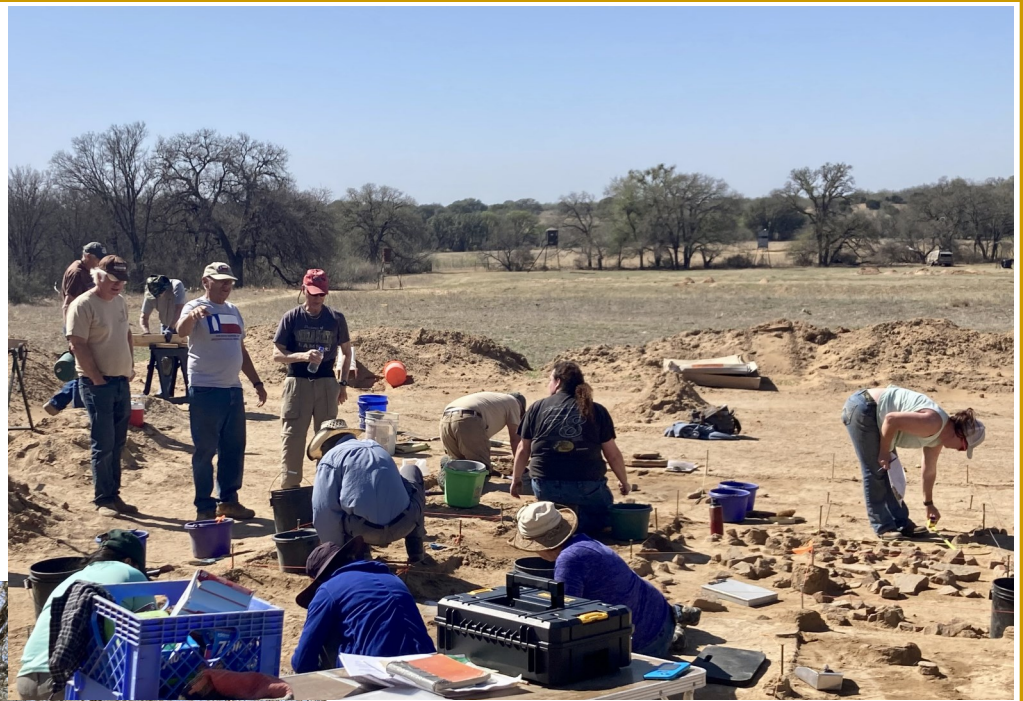
General view of grids and units with burned-rock features.