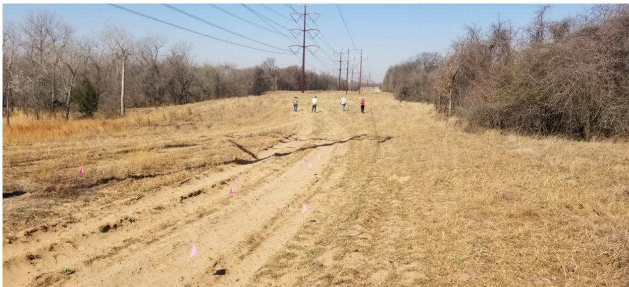
Figure 2. Happy March site (41TR341) crew recording site on March 26.