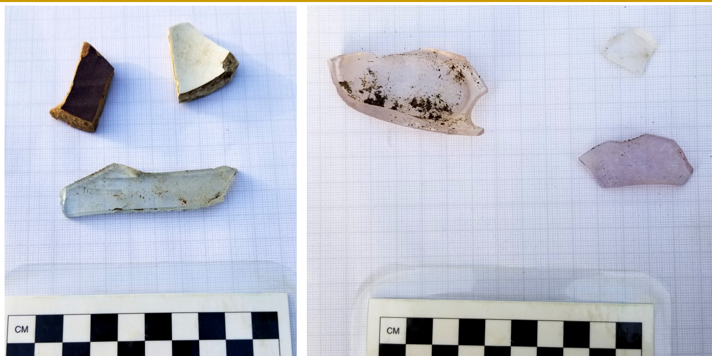
Left: Historic ceramics and glass. Right: Historic glass including bottle base.