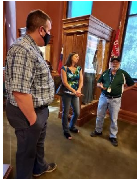
Tarrant County Courthouse ad hoc committee in the 1895 Room museum.