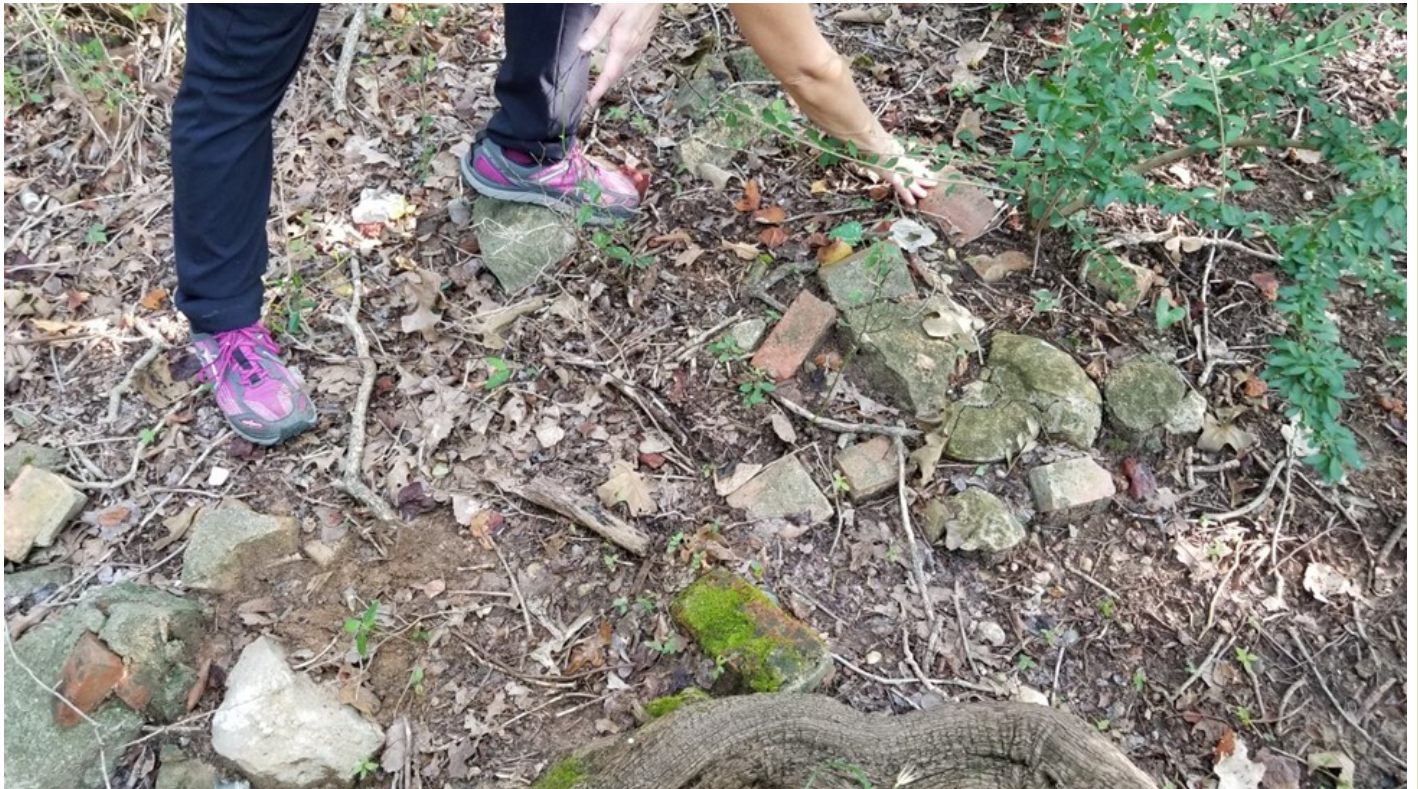
El Chignon site (41TR335).