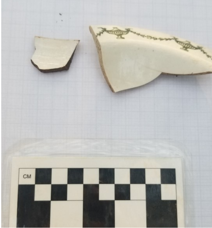
Artifacts from the El Chignon site (41TR335).