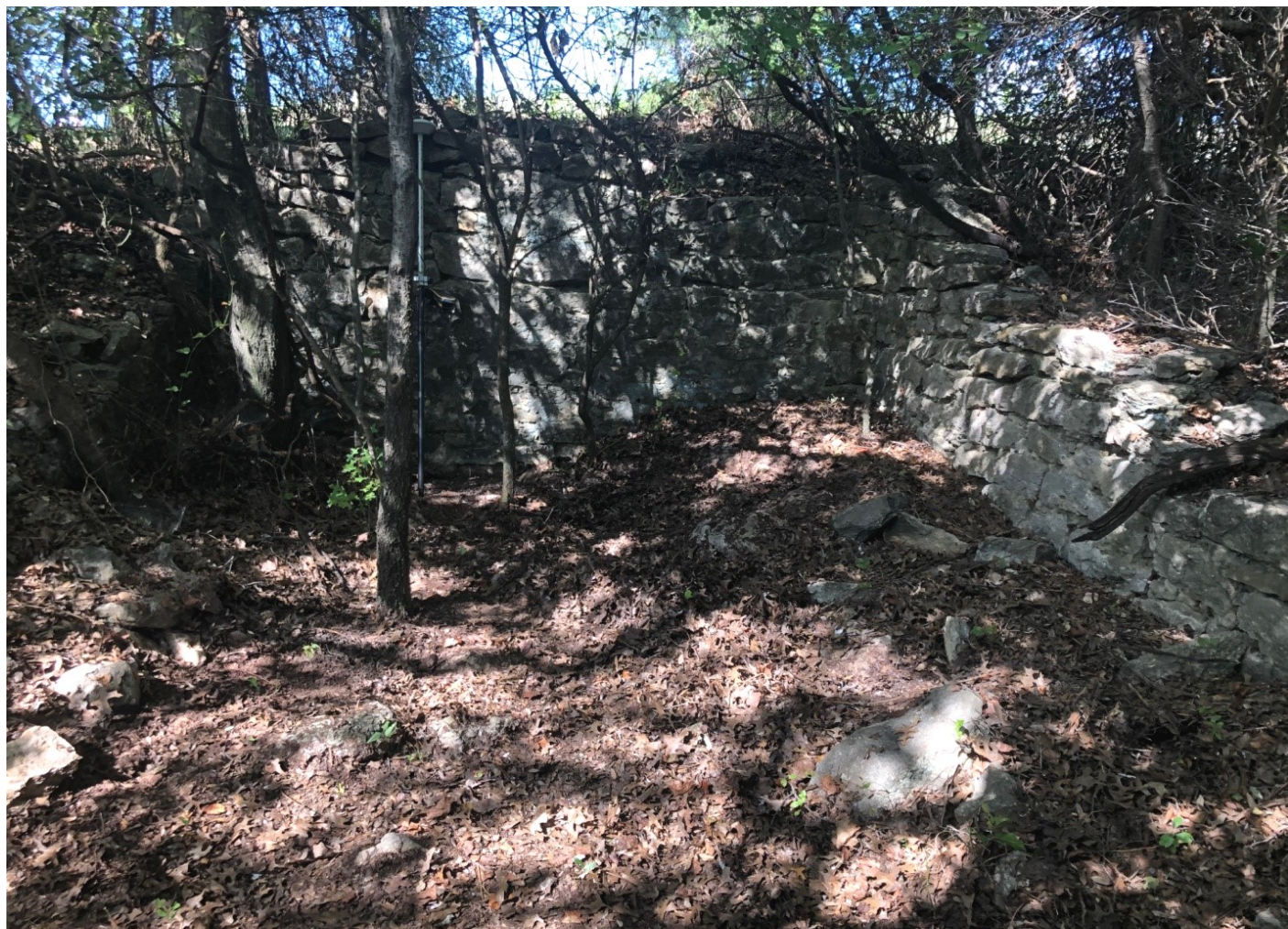
Possible root cellar at Joe Reed site (41PR223).