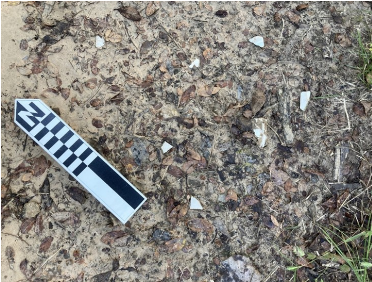
Eagle Eye site (41TR333).