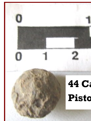
44 Caliber Pistol Ball