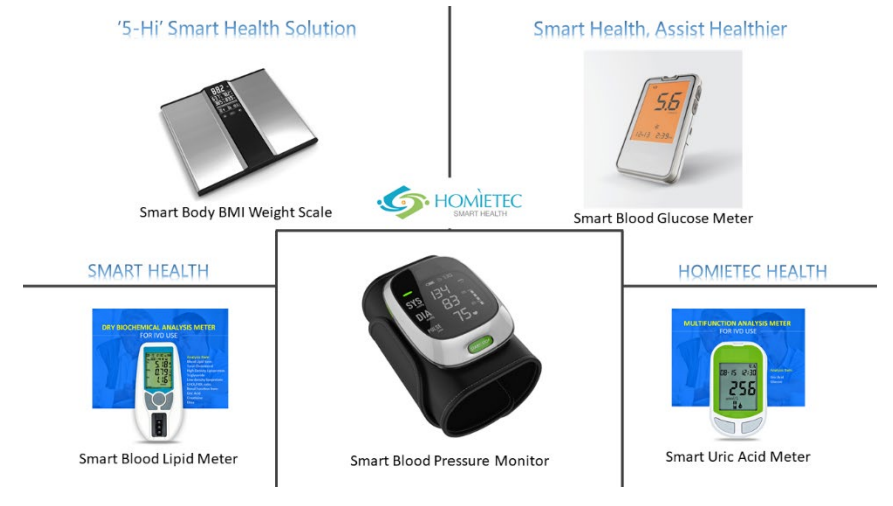
"Smart Health 5+1" health solutions with below Core products: