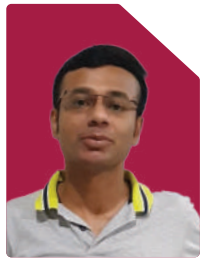
Dr. Malcolm Dermatology